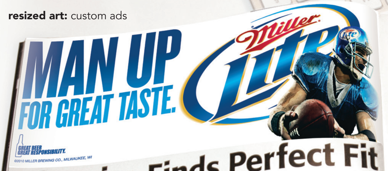
resized art: custom ads