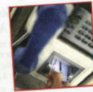
AT A PUBLIC PHONE