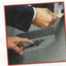
AT AN ATM

ed just to restore that CreditSecure es and long