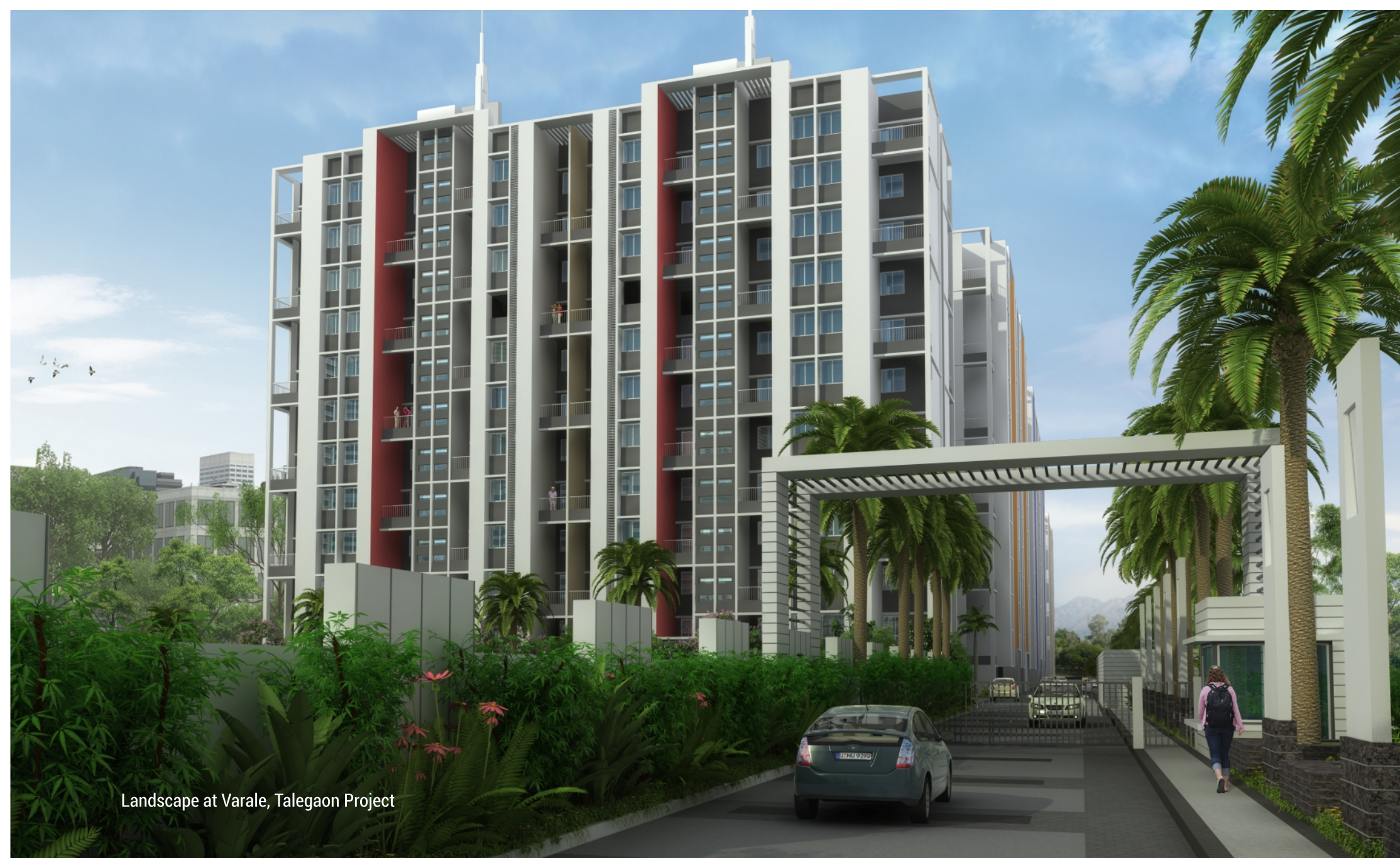
Landscape at Varale, Talegaon Project

Project expected to commence during 2016-17