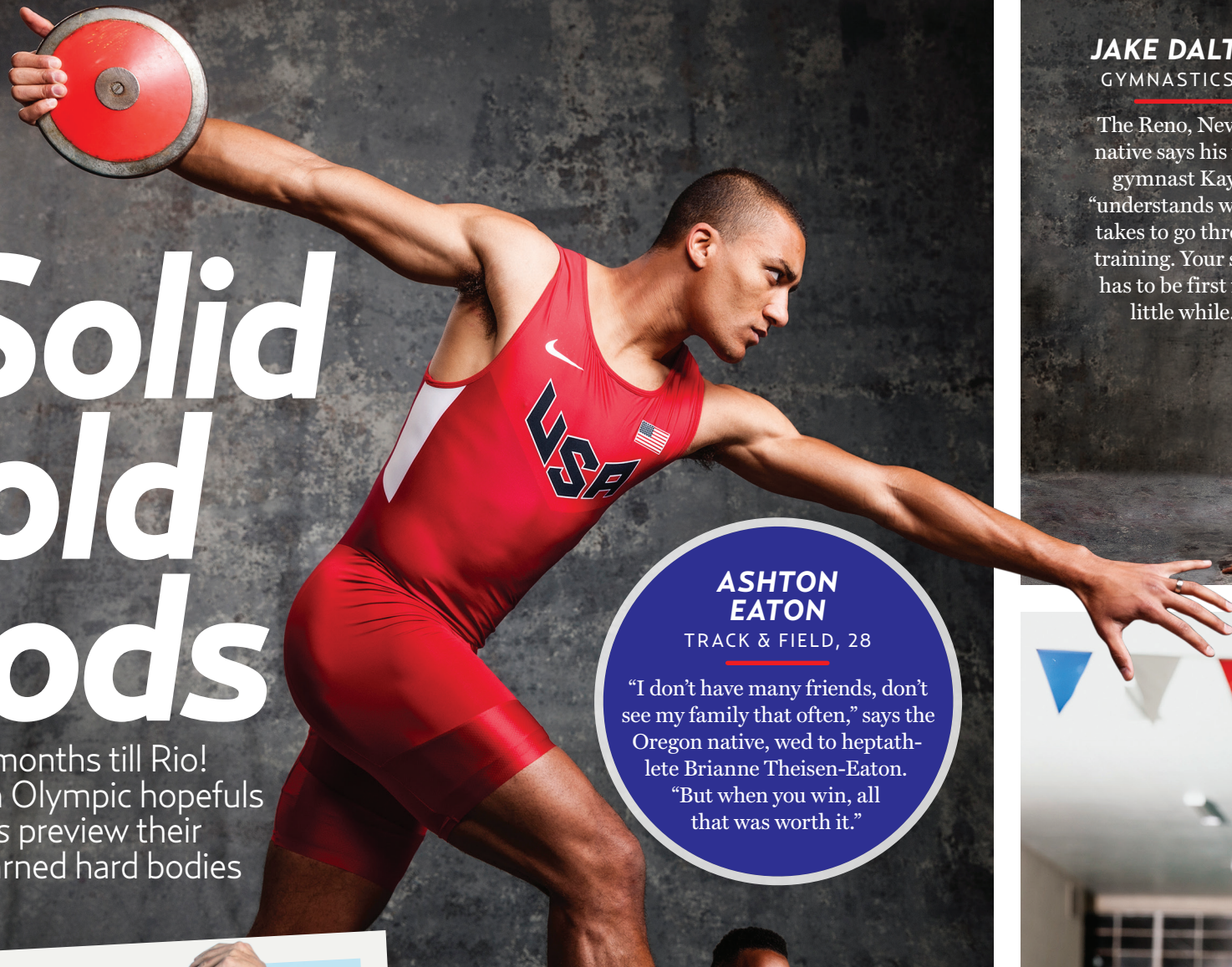
ASHTON EATON TRACK & FIELD, 28 "I don't have many friends, don't see my family that often," says the Oregon native, wed to heptathlete Brienne Theisen-Eaton. "But when you win, all that was worth it."

Two months till Rio! American Olympic hopefuls let Us preview their hard-earned hard bodies