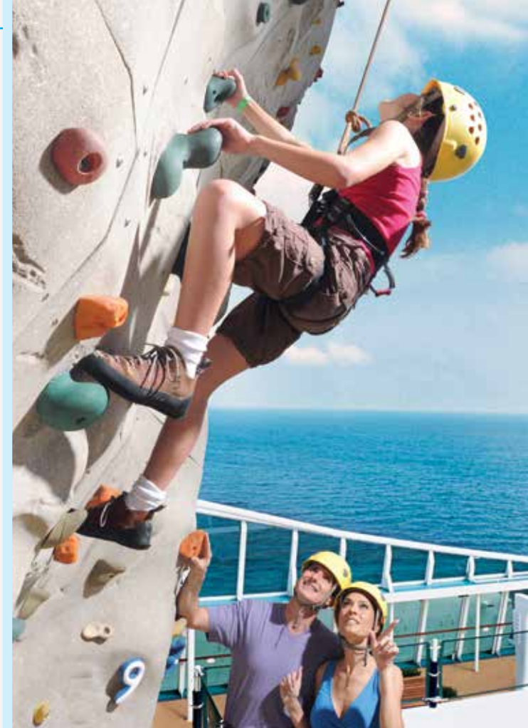
The rock-climbing wall on Royal Caribbean ships is a favorite of kids.