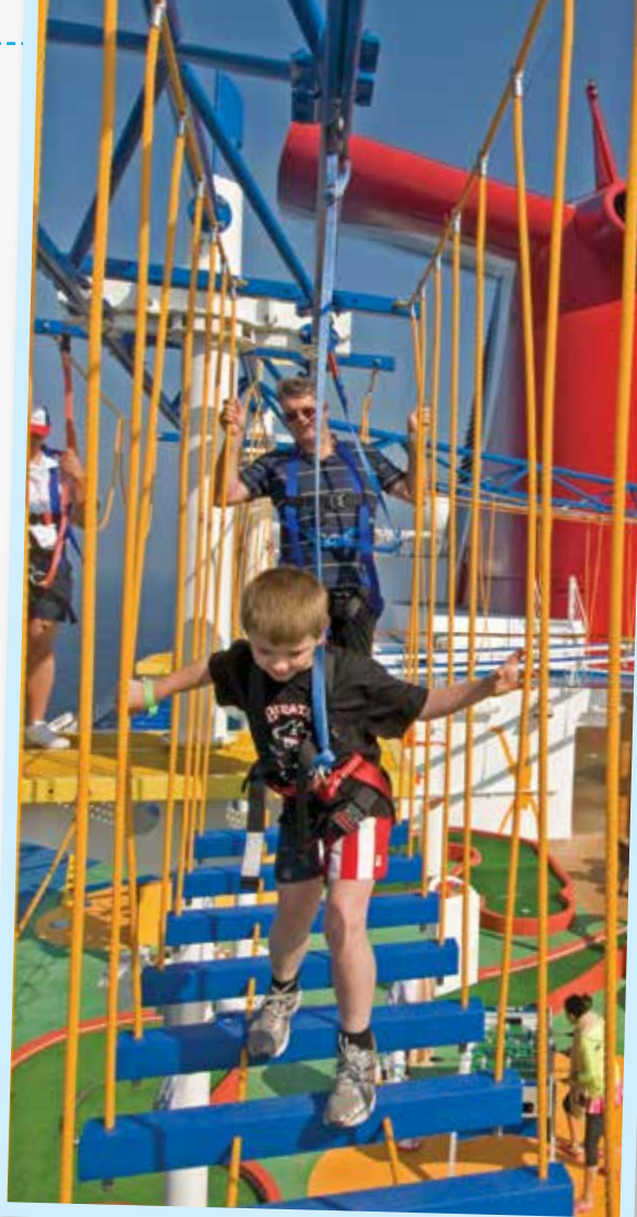
Families can challenge the Sea Course aboard the Carnival Magic .