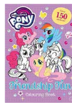
2017 titles from competitors

I ♥ Colouring: cover approach February 2017