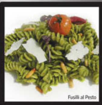
Fusilli al Pesto

For more information or to make a reservation, call us on + 971 9 204 4551