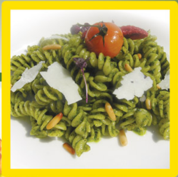
Fusilli al Pesto