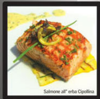
Salmore all' erba Cipollina

LE MERIDIEN AL AQAH BEACH RESORT N 25° 30' E 56° 21' T + 971 9 244 9000 lemeridien.com/fujairah