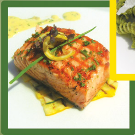
Salmone all' erba Cipollina