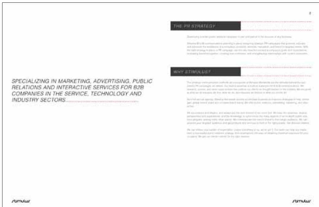
marketing brochure • 8.5"x 11.0"