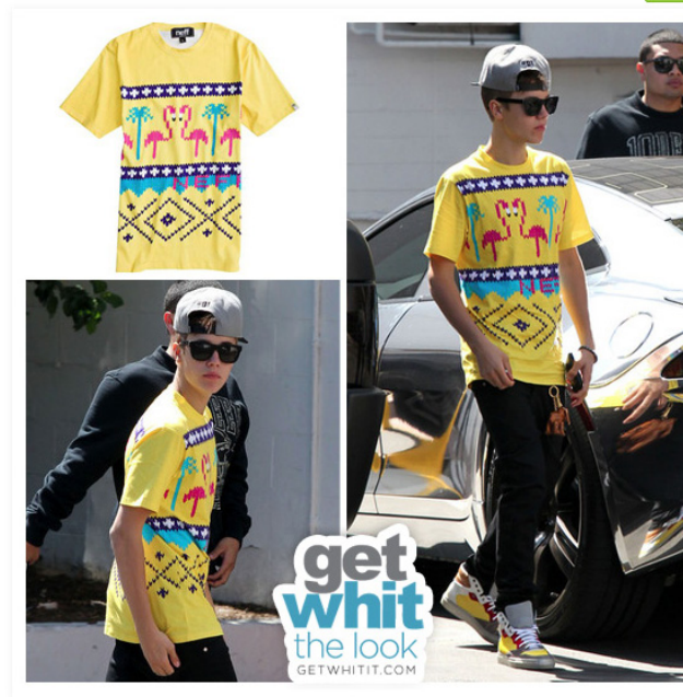
Mr. Swaggy himself, Justin Bieber was spotted arriving to a Beverly Hills hotel the other day wearing a yellow Neff Flamingo Mingle Tee.