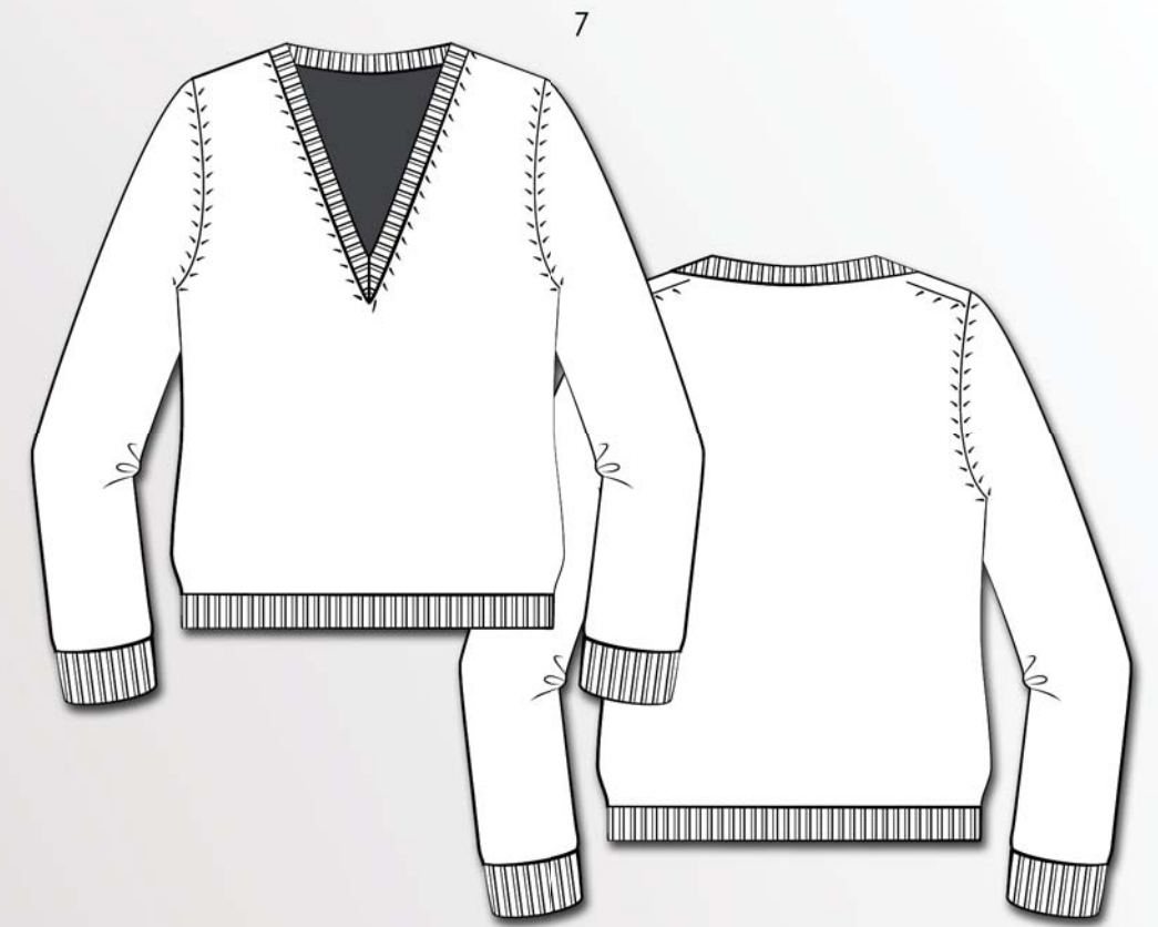
7 BRENDAN V-NECK SWEATER SOFT KNIT WITH LONG SLEEVES FINELY RIBBED TRIM AT NECKLINE, CUFFS AND HEM 100% COTTON