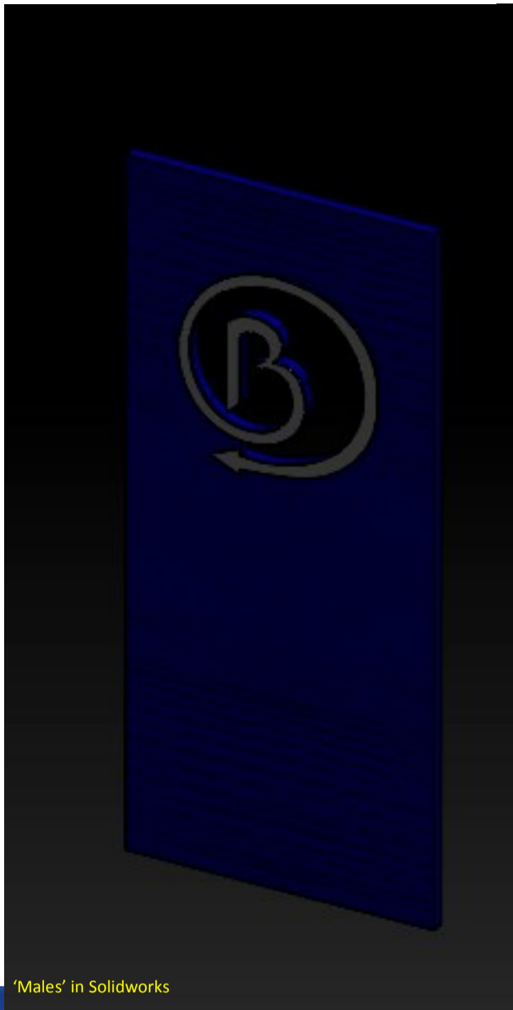
'Males' in Solidworks