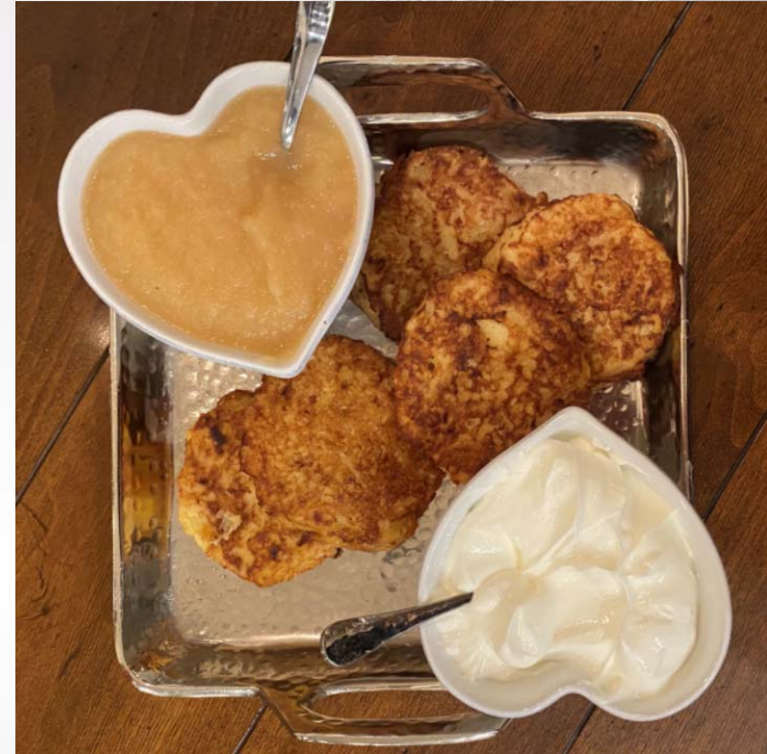
Alan Roga Hanukkah lights & potato latkes (traditional dish)