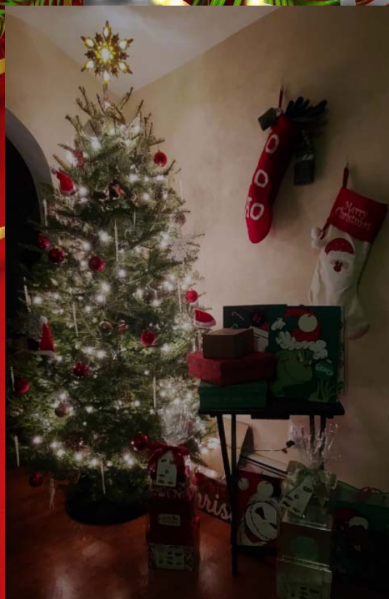
Hayley Snow 2020 Christmas Tree