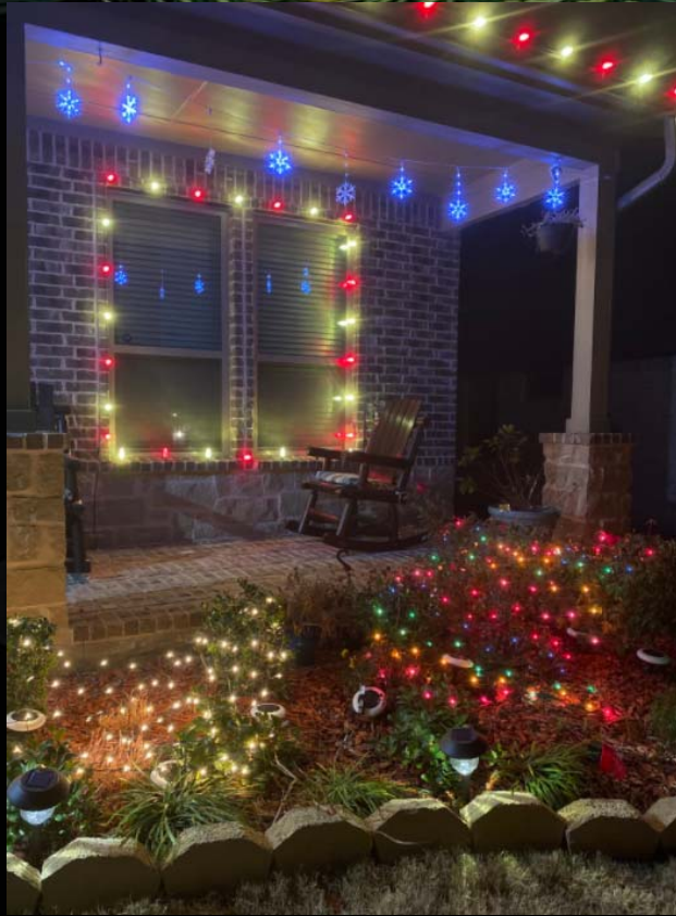
Sreeja Job Christmas lights in our front porch