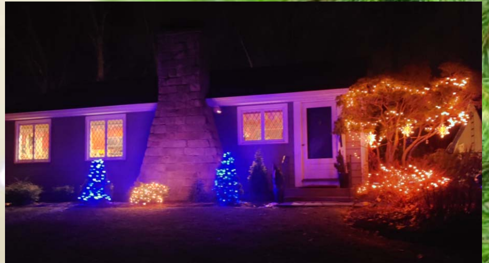
Keshara Alleyne Beautiful houses in my neighborhood