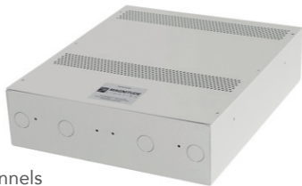
4 to 7 Channels 34.7"L x 15"W x 4.17"H