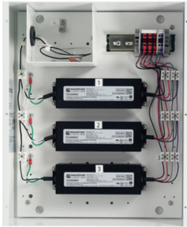
2 to 3 Channels 17.83"L x 15"W x 4.17"D