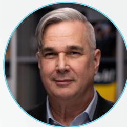
SCOTT B. MELVIN Executive Deputy Commissioner New York State Department of Labor