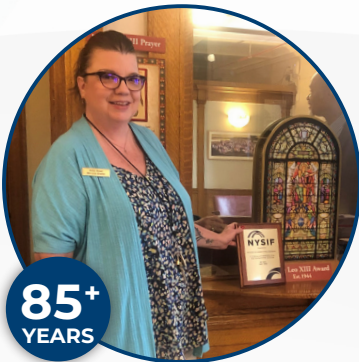
Leo House for German Immigrants New York, NY