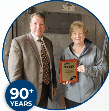
Wolff & Dungey, Inc. Syracuse, NY