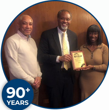
American Museum of Natural History New York, NY

We are honored that our commitment to redefining excellence and providing outstanding service to our policyholders has helped us earn their continued trust and ongoing business for generations.