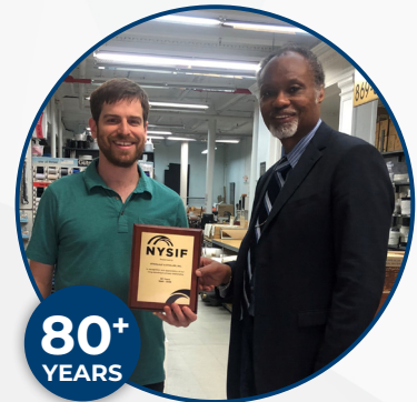
Steinlauf & Stoller, Inc. New York, NY