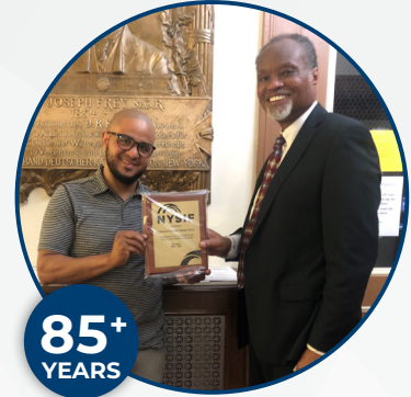
Catholic Kolping Society of New York New York, NY