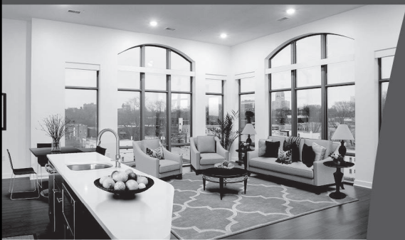
Park South Apartments, Albany

26 of the area's finest apartment communities