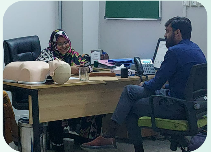
Manikin Calibration activity was initiated with Laerdal company representative. Fruitful discussion was held and laerdal team agreed to calibrate manikin in Hyderabad and Sukkur RO too