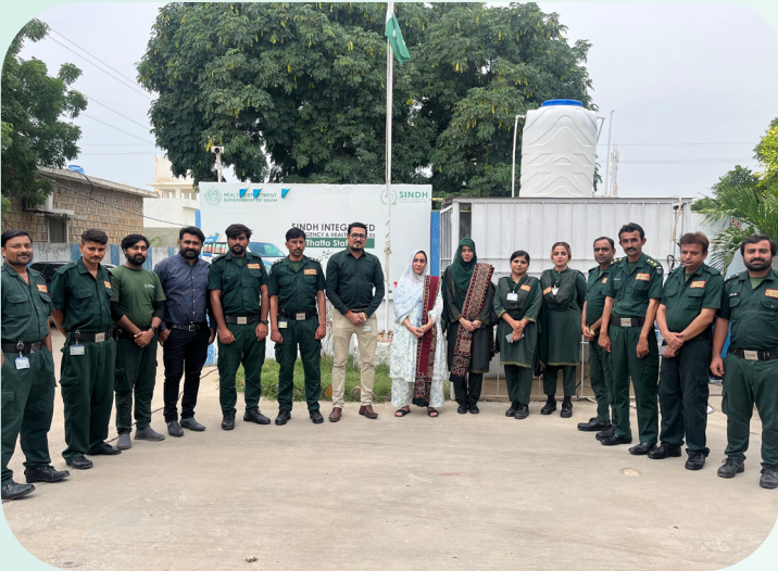
Teaching Assistant/CME Sessions