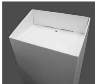
Step 7 Fold the back tab down and push to secure the tabs into the floor.