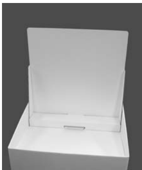
Step 11 Place the header onto the unit. Lock into place by lifting the tab from the unit into the header slot.