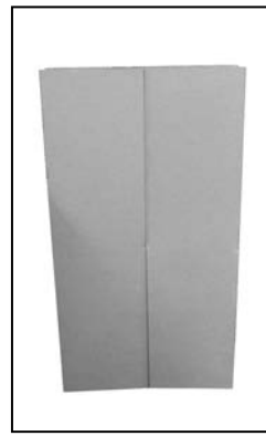
Step 4 Locate the interior structure filler and push open.