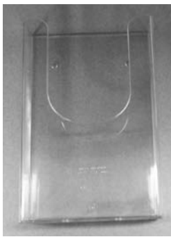
Step 12 Locate the clear pocket holder.