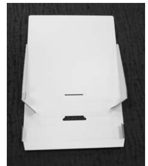
Step 9 Fold the side and tabs up and inward.