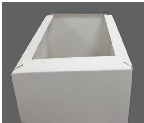
Step 2 Flip the unit upside down and push open. Fold the bottom tabs down and inward. Fold the front and back bottom tabs down and lock into the side tab slots.