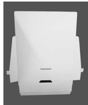
Step 8 Locate the header and pre-fold all folds.