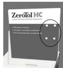
Step 13 There are 4 pieces of pre-installed tape on the header. Un-peel the tape and align the clear pocket with the graphic blue line. Press to secure into place.