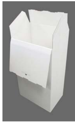
Step 3 Flip the unit upright.