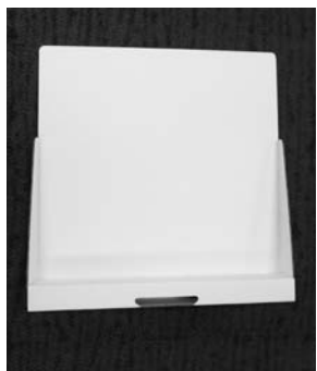
Step 10 Fold the front panel up, over and into the header. Secure by locking the tab into the back slot.