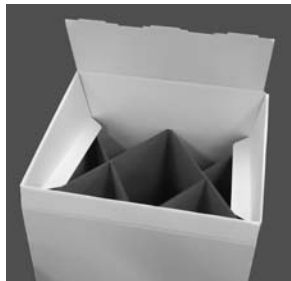
Step 5 Insert the interior structure filler into the unit as shown. Fold the unit's side tabs down and inward as shown.