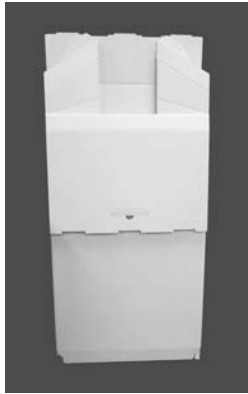
Step 1 Locate the unit and pre-fold all folds.