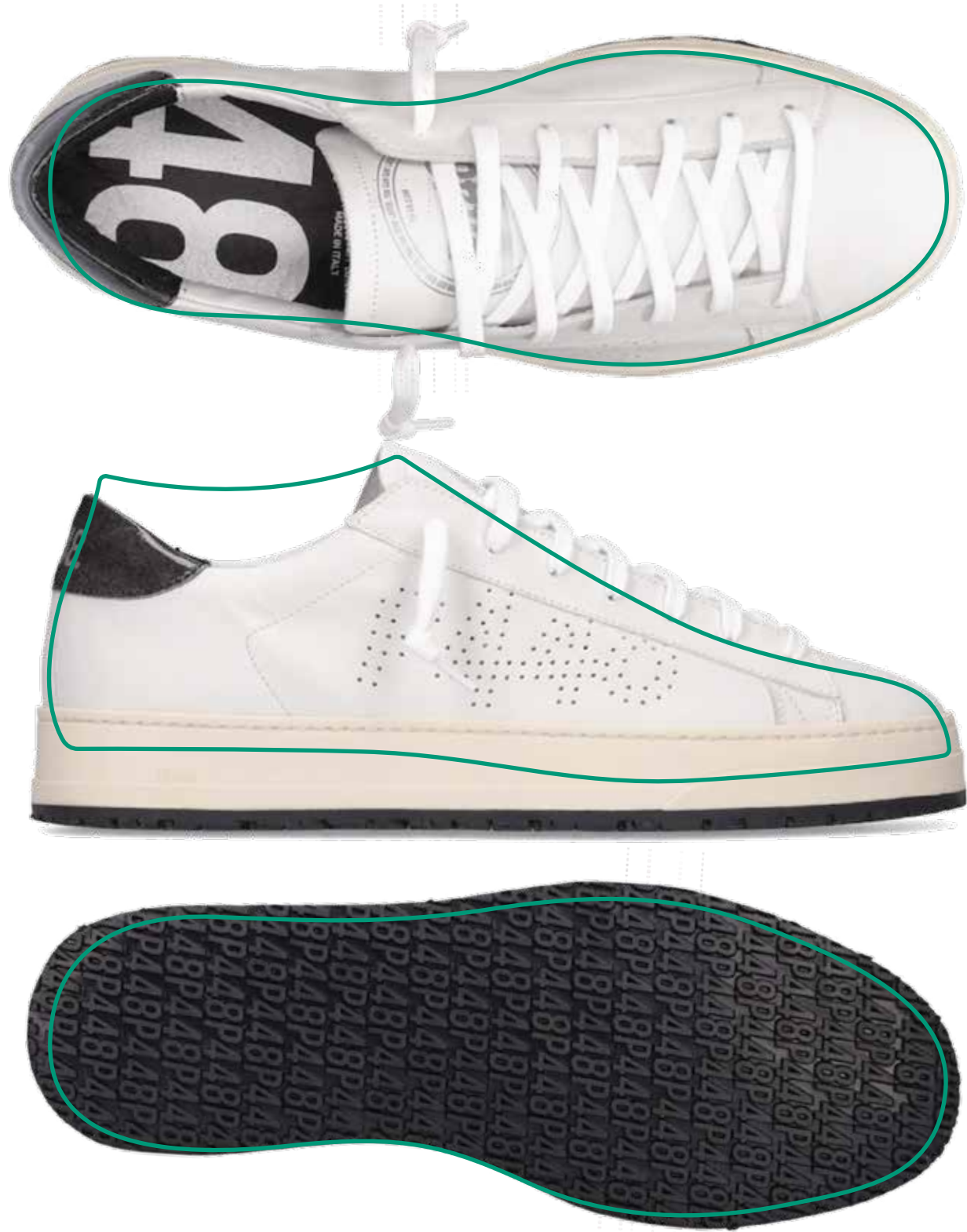
P448 Jack Low