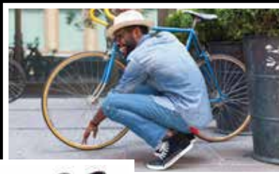
TSF: DYLE AND DUNPHY