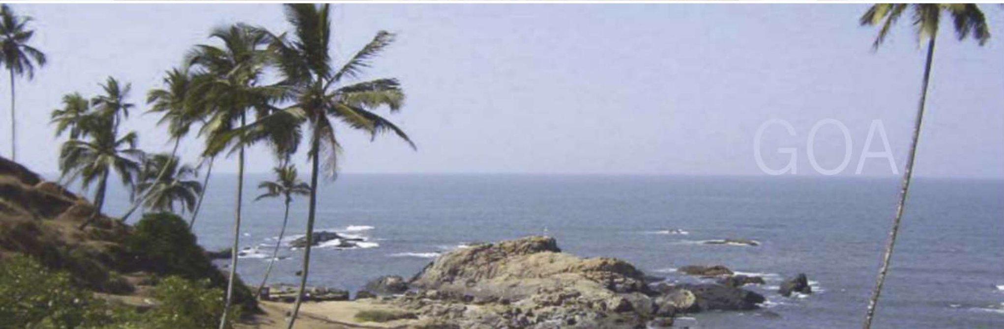
DBEPL Factory Unite: I Pernem, Goa