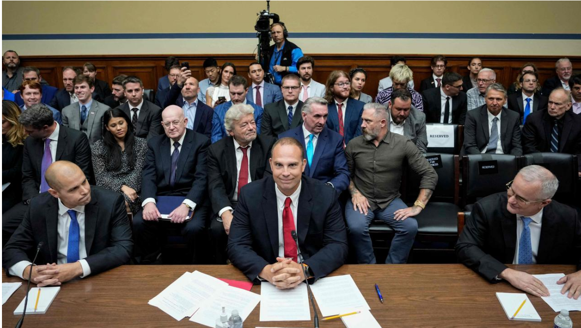
Congress has held several UAP hearings.