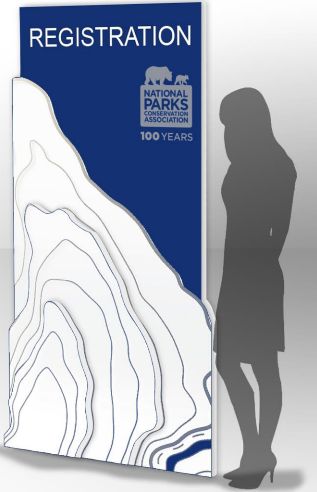
graphic option A