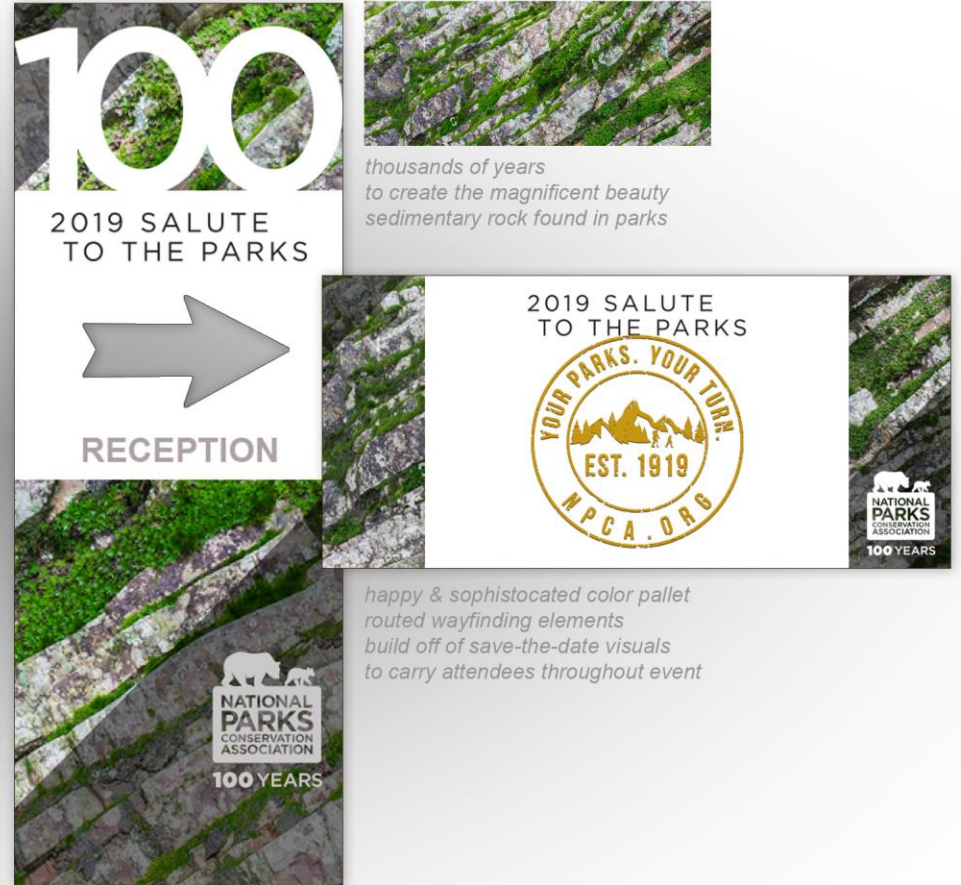
graphic option B (included in pricing)

thousands of years to create the magnificent beauty sedimentary rock found in parks