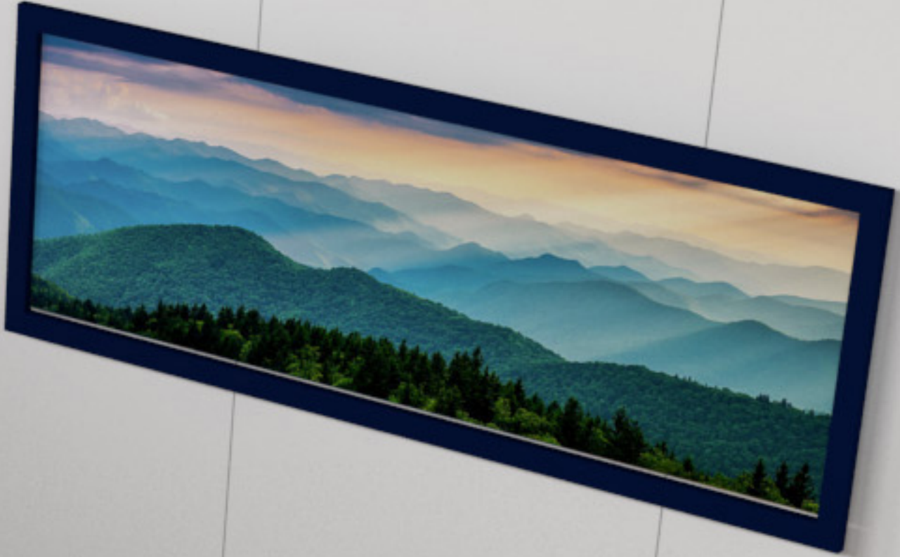
G7 Leader's Summit 2020 CLIN008 Modular Office Space View 2 Version 2