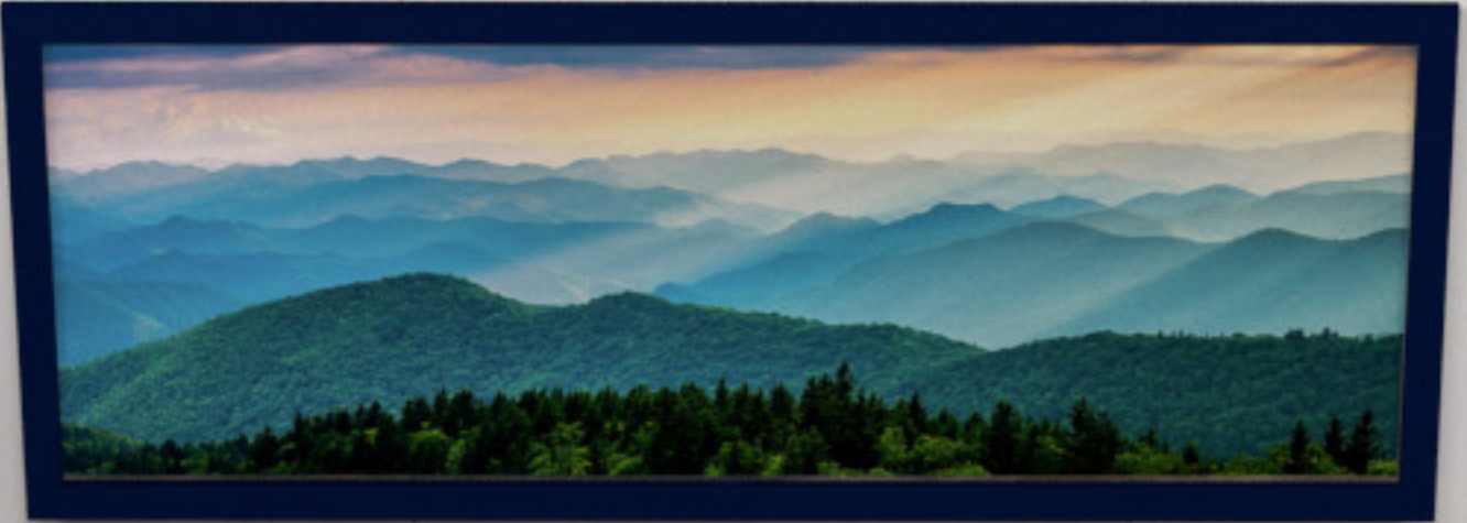
G7 Leader's Summit 2020 CLIN008 Modular Office Space View 1 Version 2