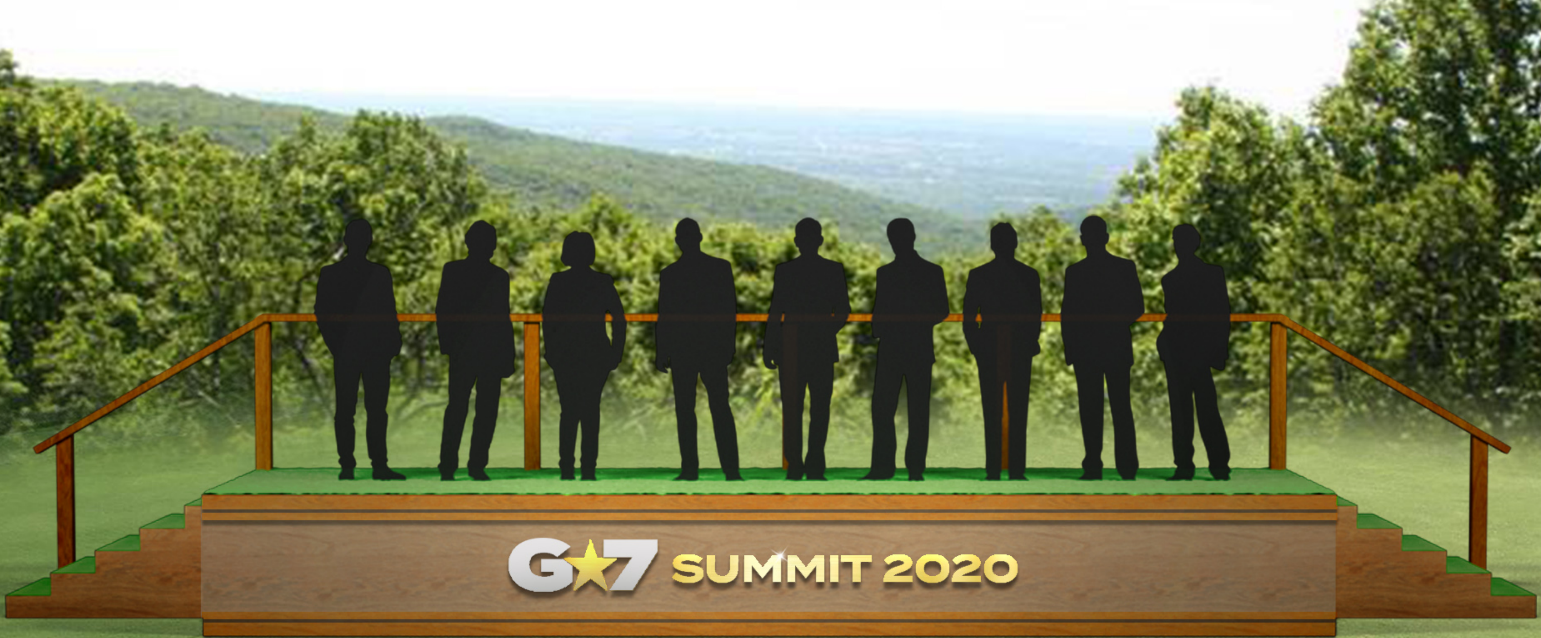
G7 Leaders' Summit 2020 CLIN011_Family Photo