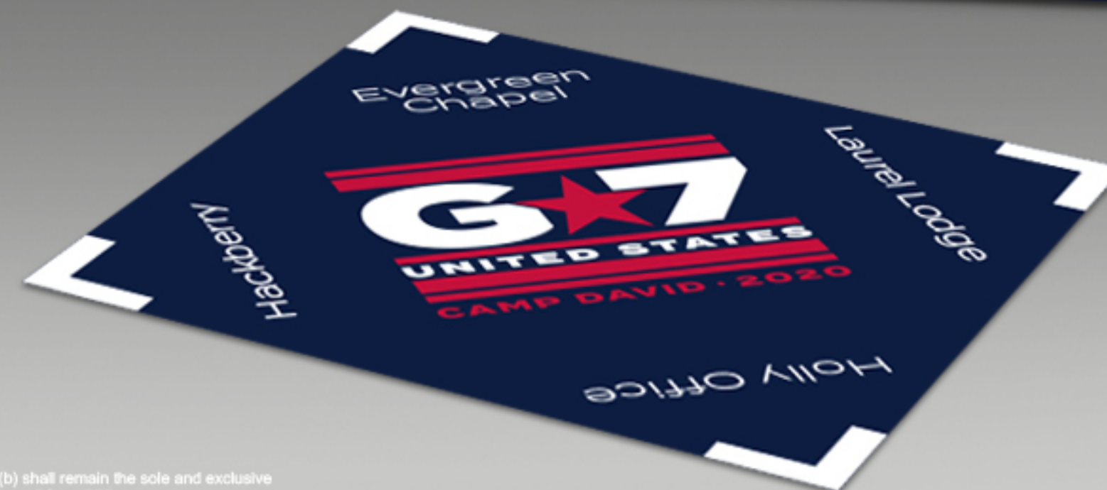
G7 Leaders' Summit 2020 CLIN020_Signage