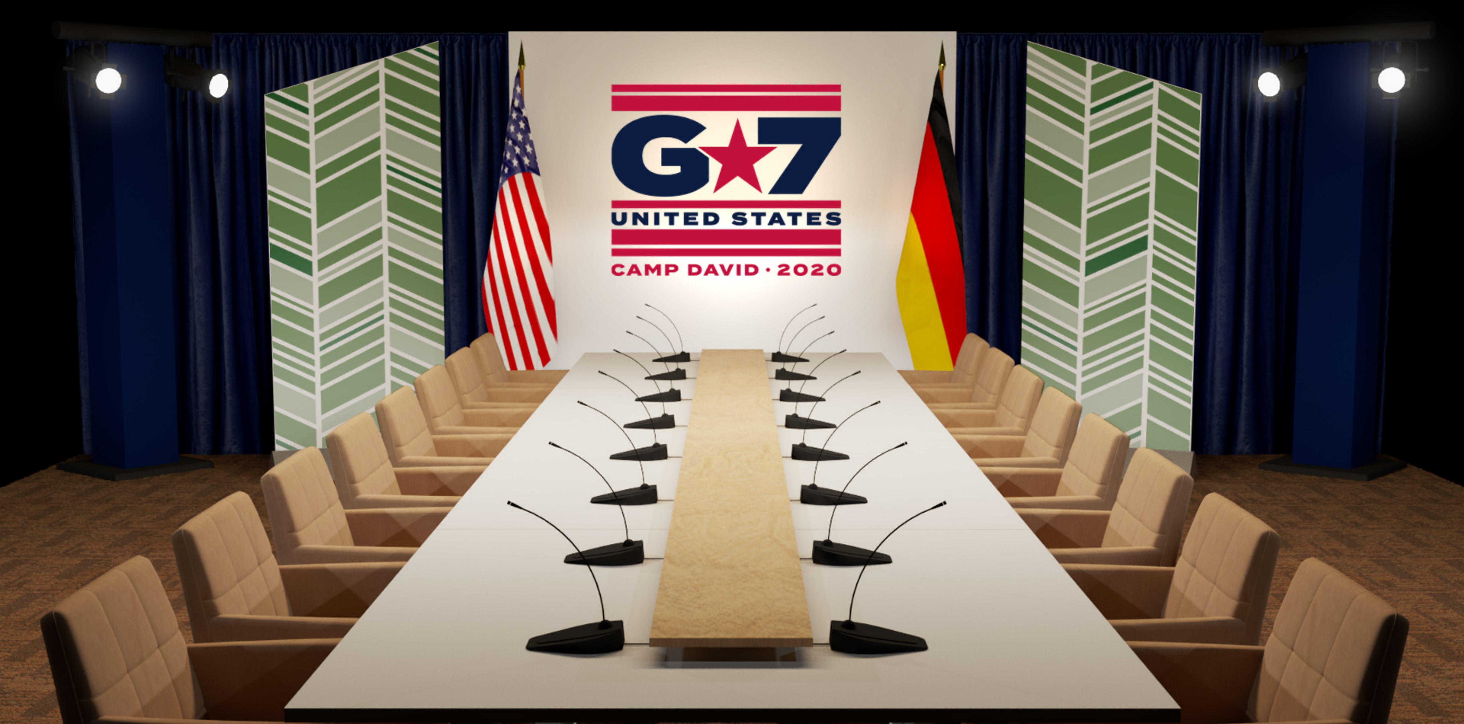
G7 Leaders' Summit 2020 CLIN009_Bilateral Meeting-Library