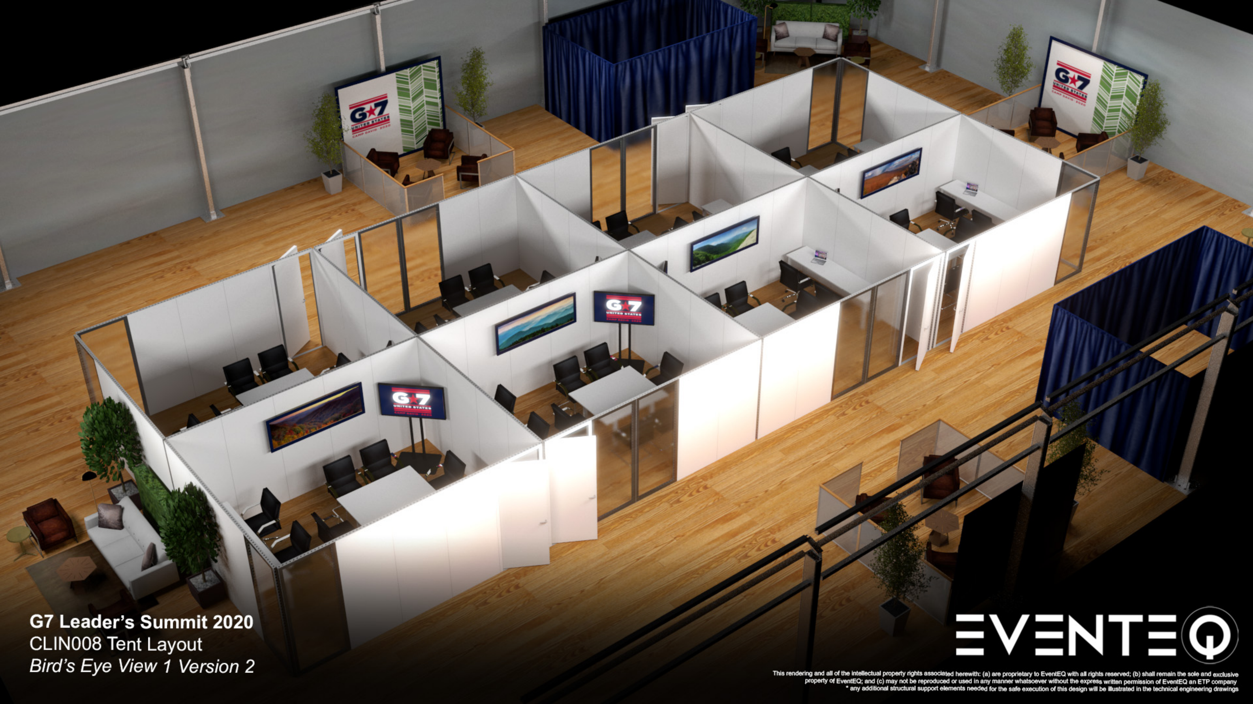
G7 Leader's Summit 2020 CLIN008 Tent Layout Bird's Eye View 1 Version 2