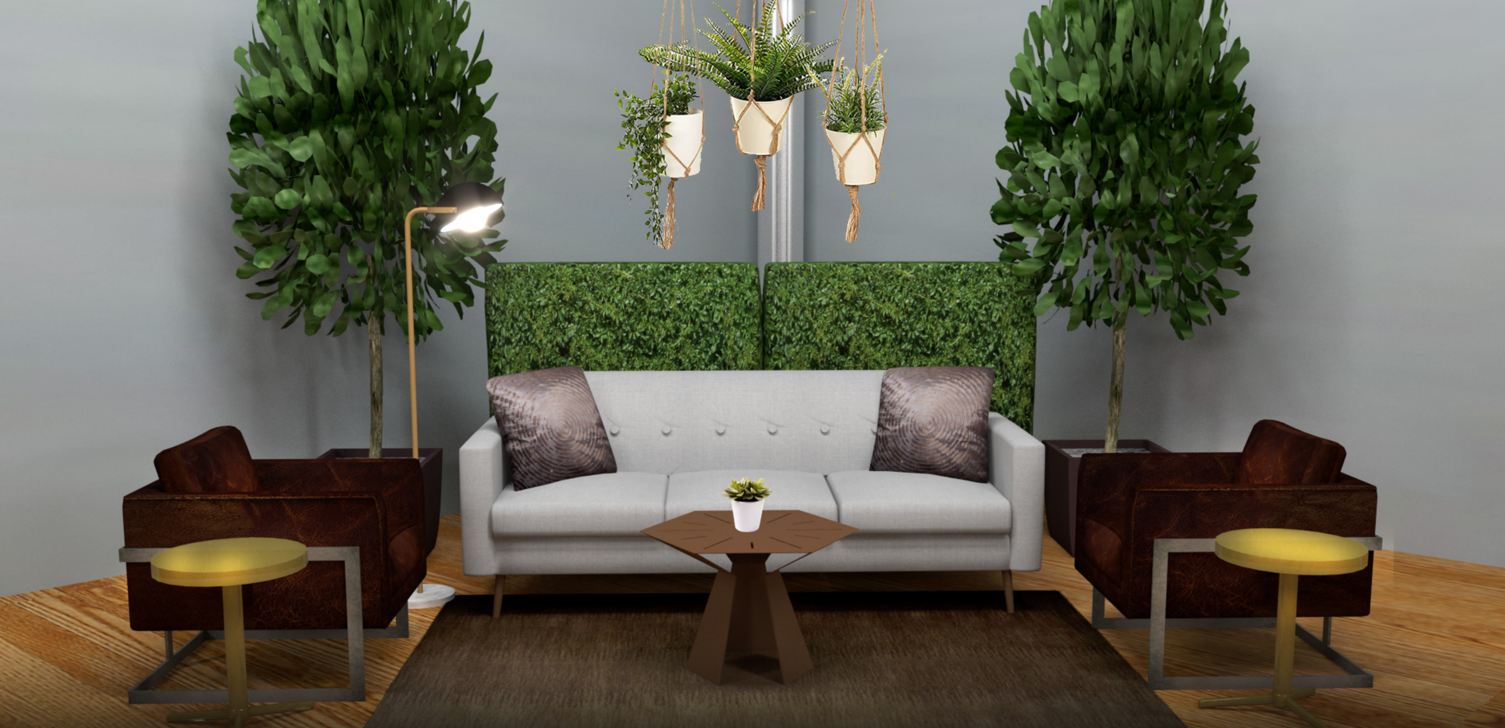
G7 Leader's Summit 2020 CLIN008 Lounge Vignette Opiton 1 View 1 Version 2