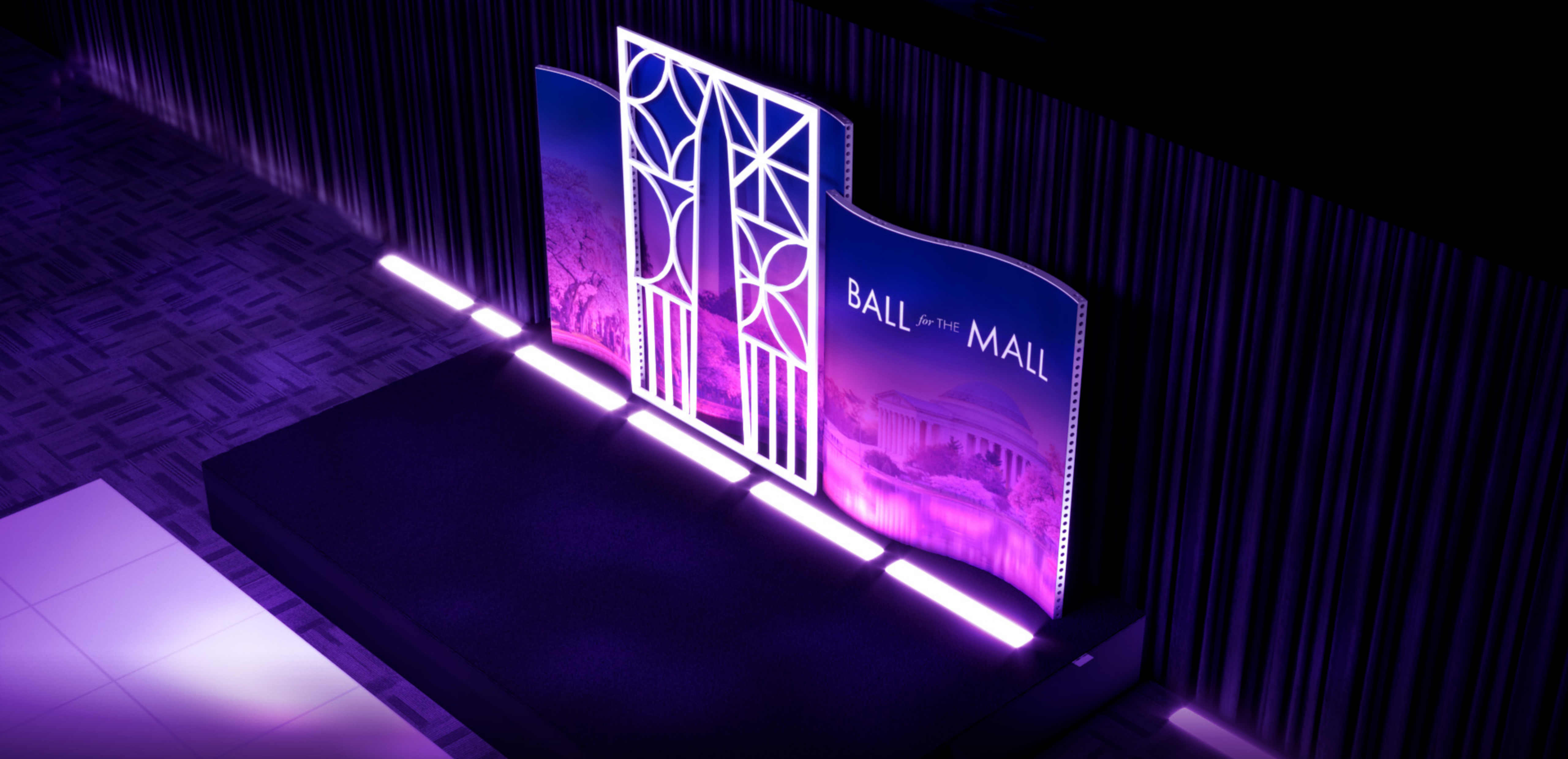
Ball for the Mall 2020 Stage 20'w x 12"d x 2'h with Routed and Modular Scenic Stage Birdseye View 1 Version 1