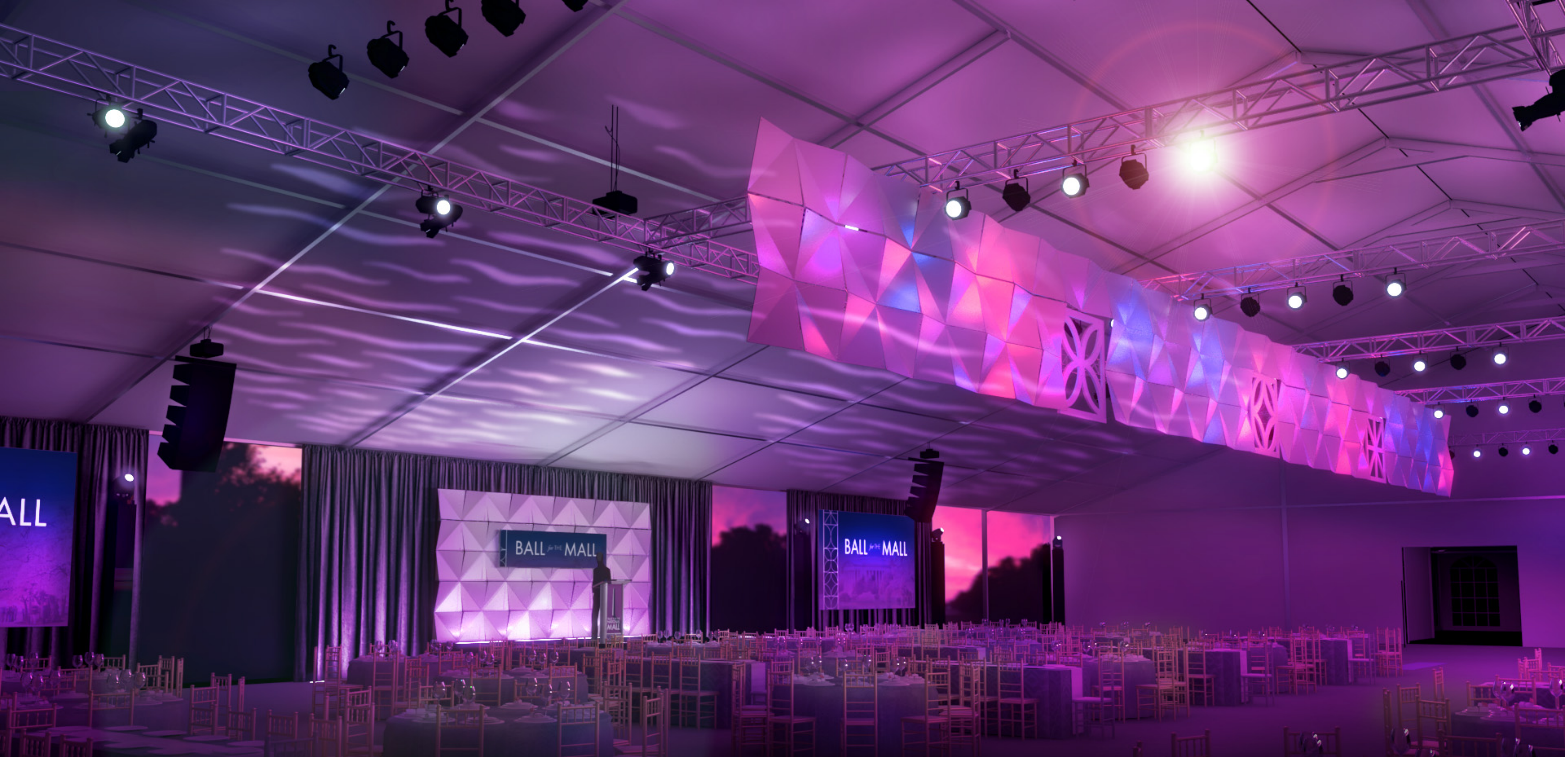
Ball for the Mall 2020 Stage 20'w x 12'd x 2'h with Routed and Modular Scenic Stage Option 2 View 3 Version 2