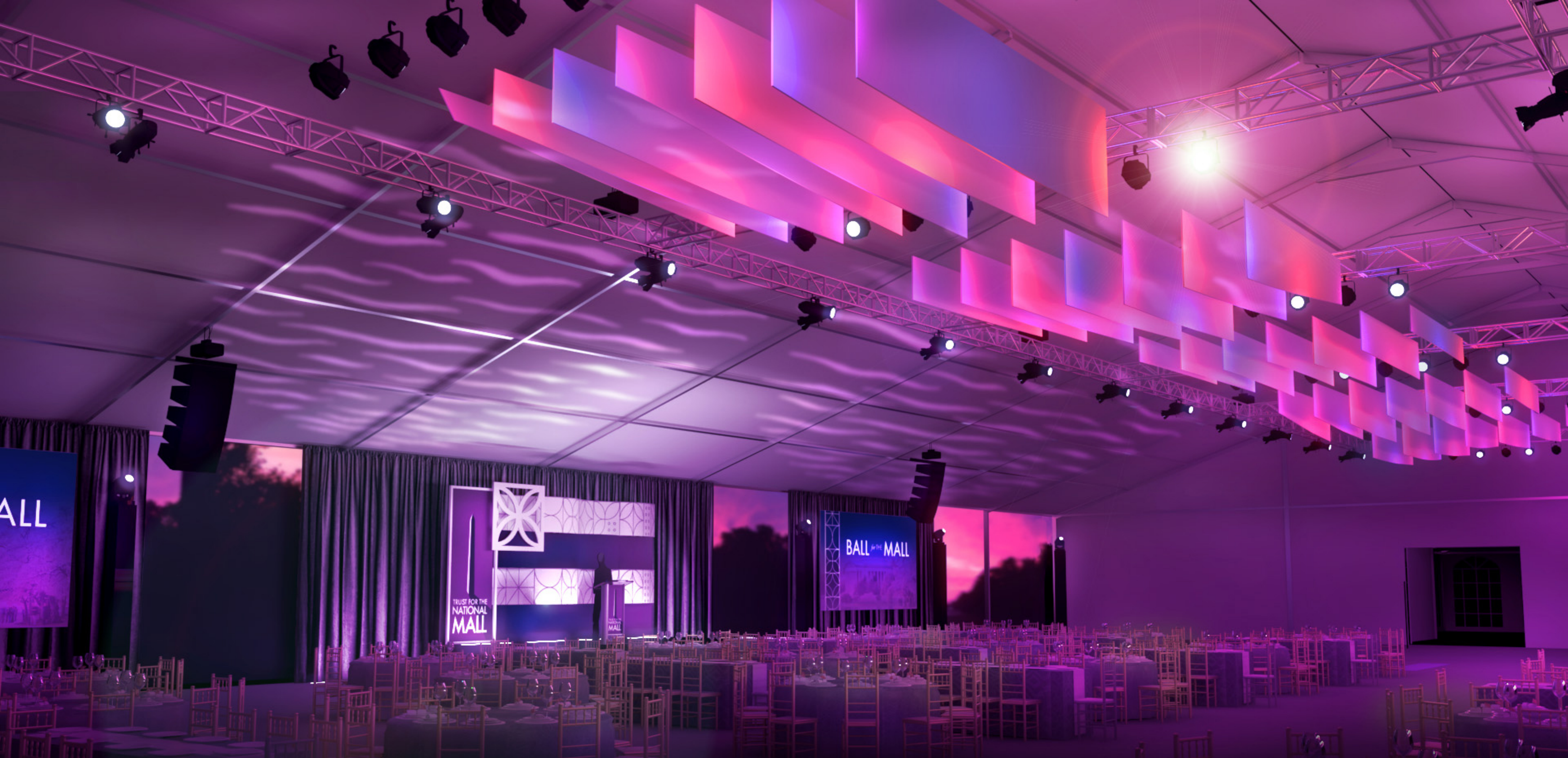
Ball for the Mall 2020 Stage 20'w x 12"d x 2'h with Routed and Modular Scenic Stage Option 1 View 3 Version 1