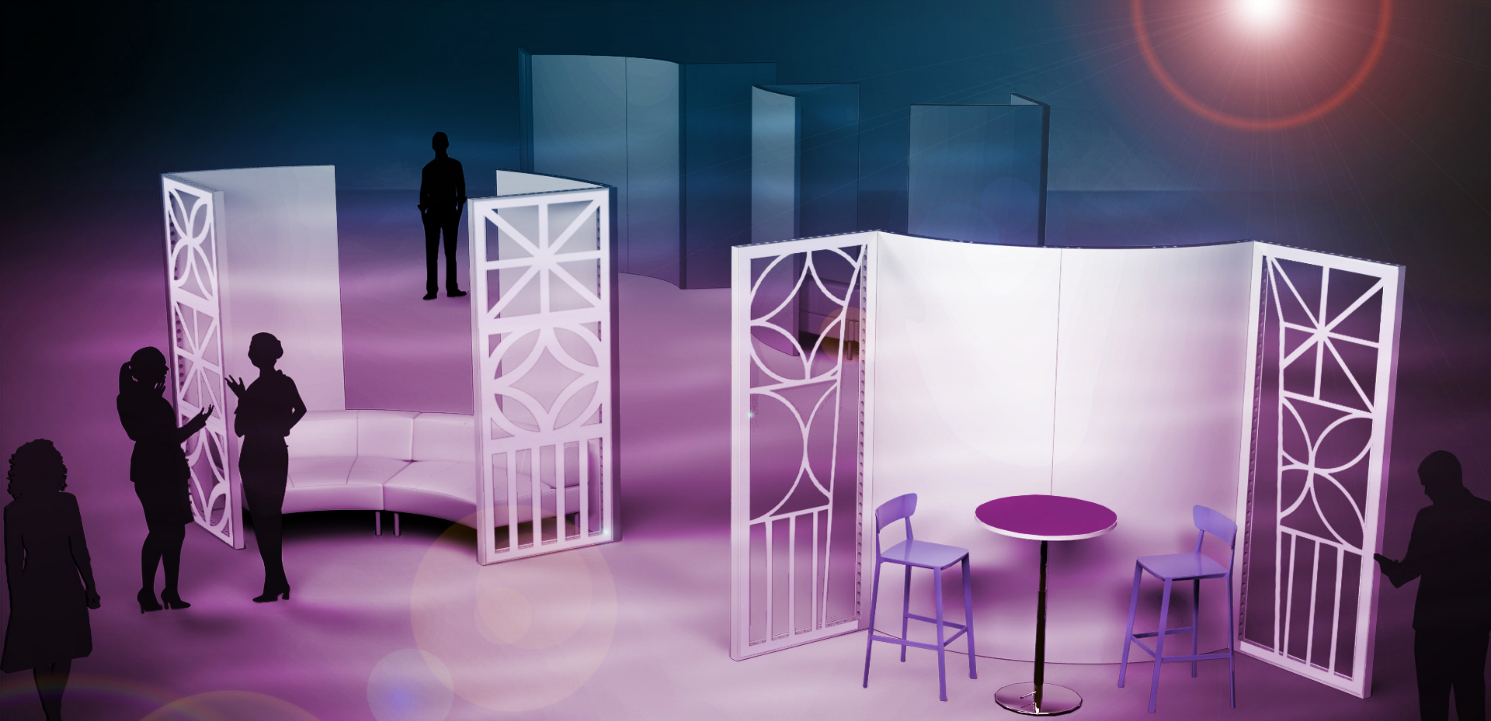
Ball for the Mall 2020_ Trust for the Mall Vignette_ Quiet Area