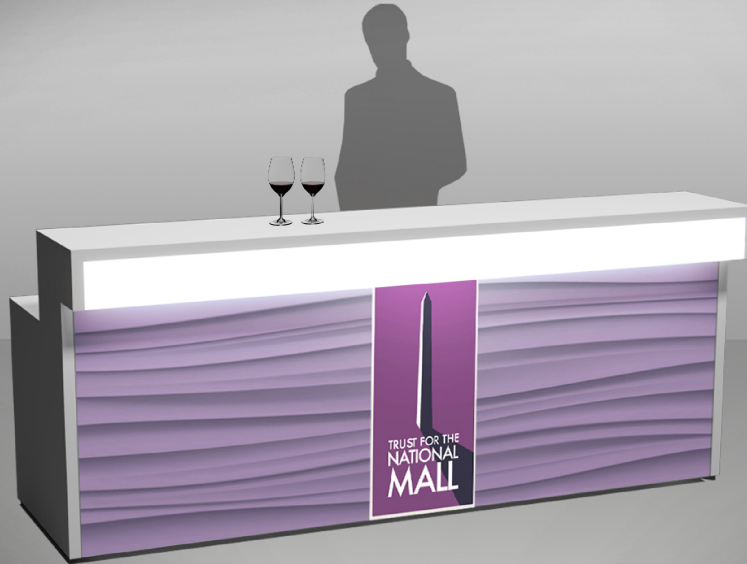
Ball for the Mall 2020_Trust for the Mall Bar_Branded