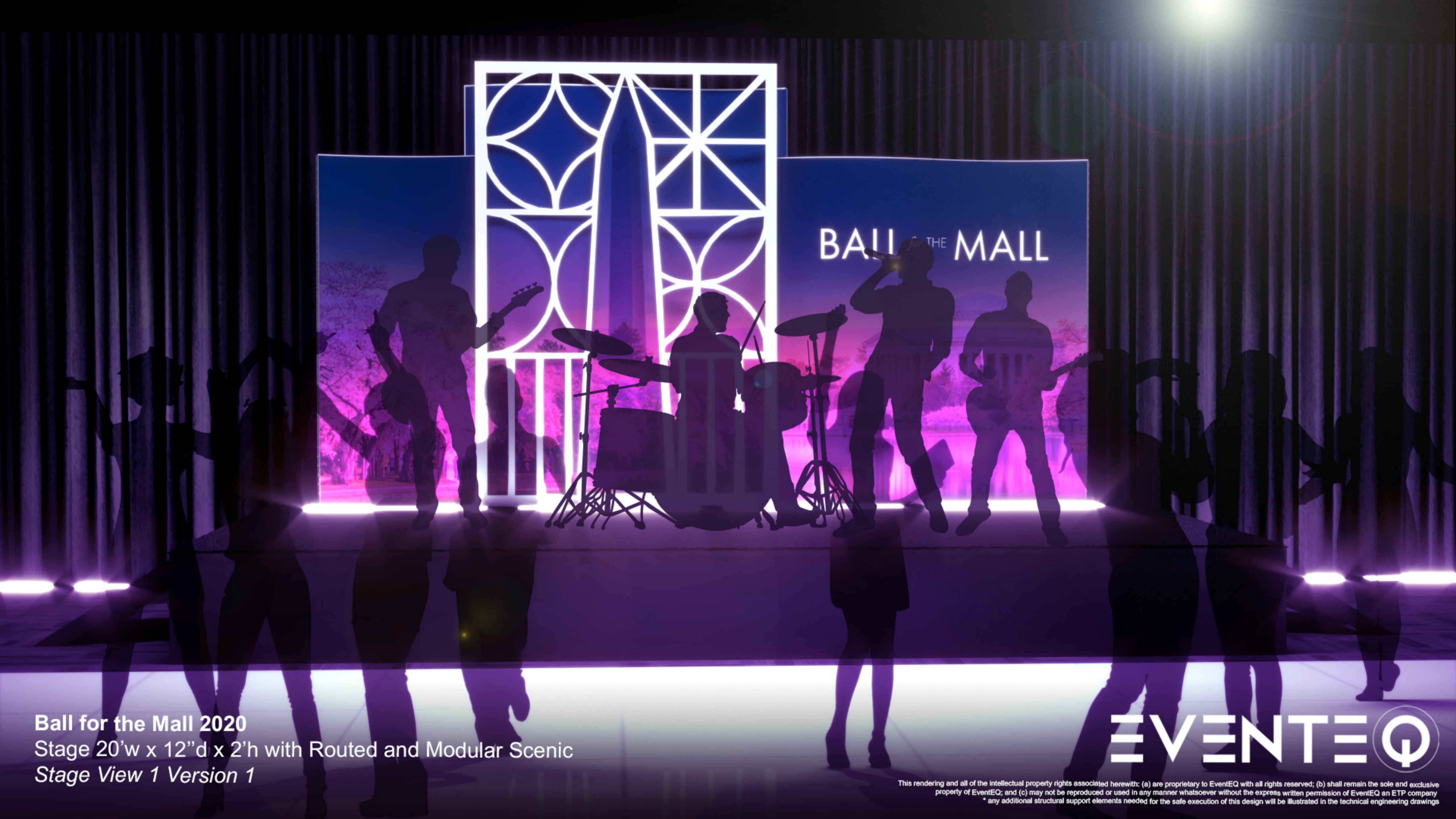
Ball for the Mall 2020 Stage 20'w x 12"d x 2'h with Routed and Modular Scenic Stage View 1 Version 1