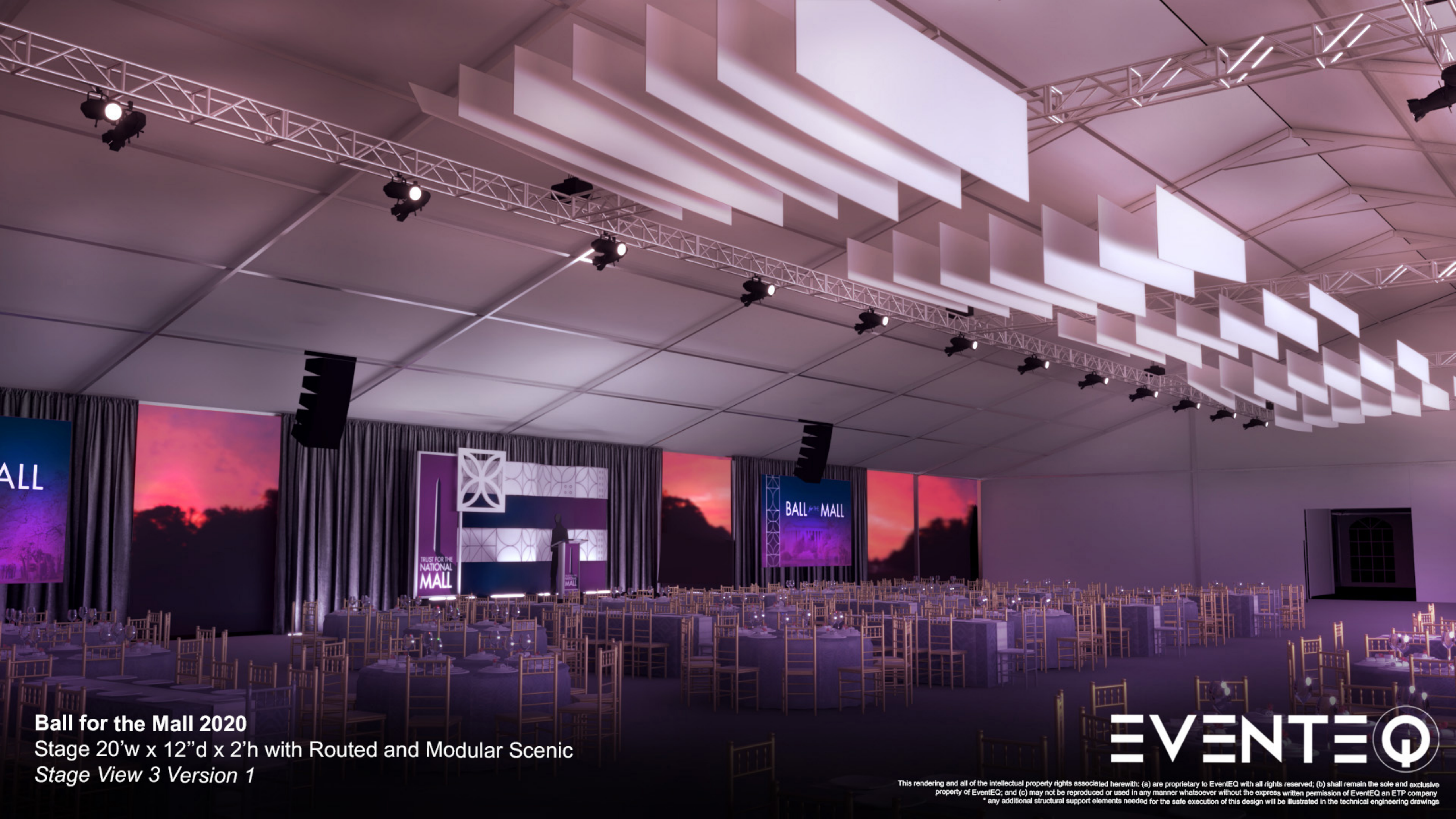
Ball for the Mall 2020 Stage 20'w x 12"d x 2'h with Routed and Modular Scenic Stage View 3 Version 1