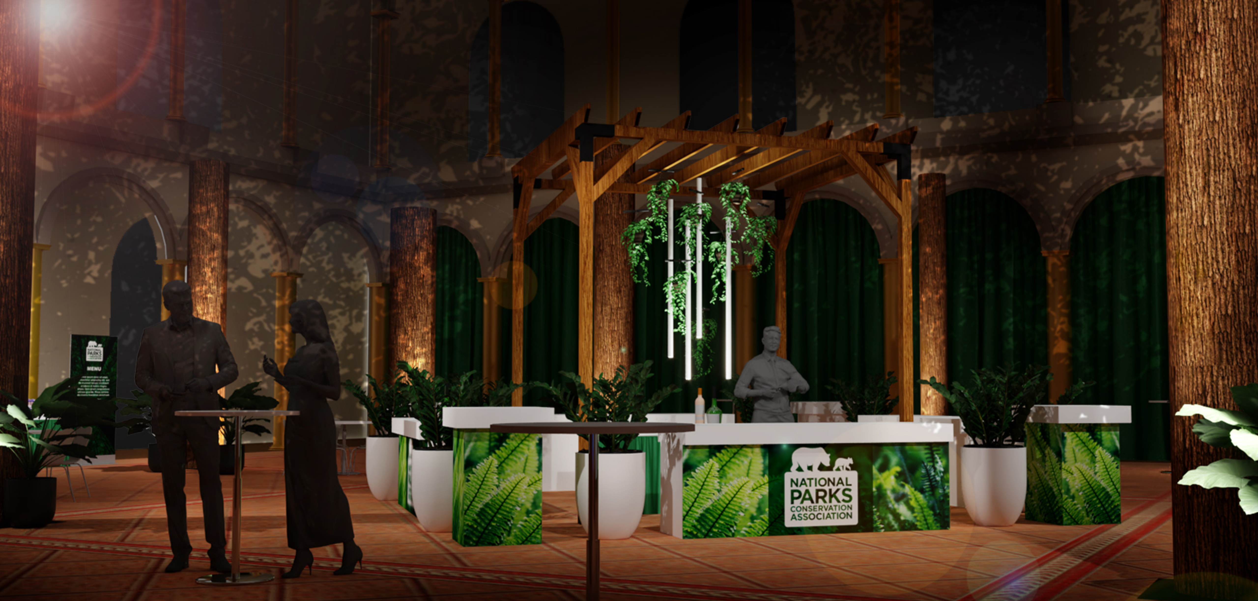
NPCA Salute to the Parks 2023 Reception_Shenandoah forest_v02