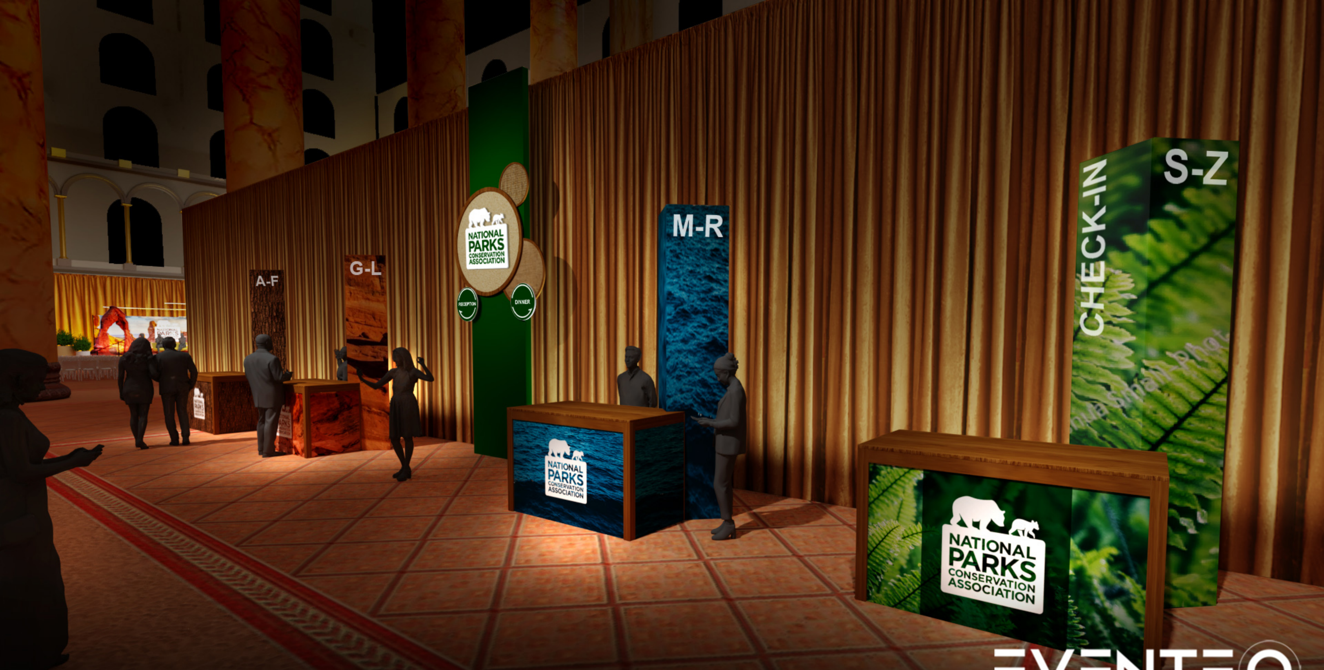
NPCA Salute to the Parks 2023 Check-In_various landscape textures_v02