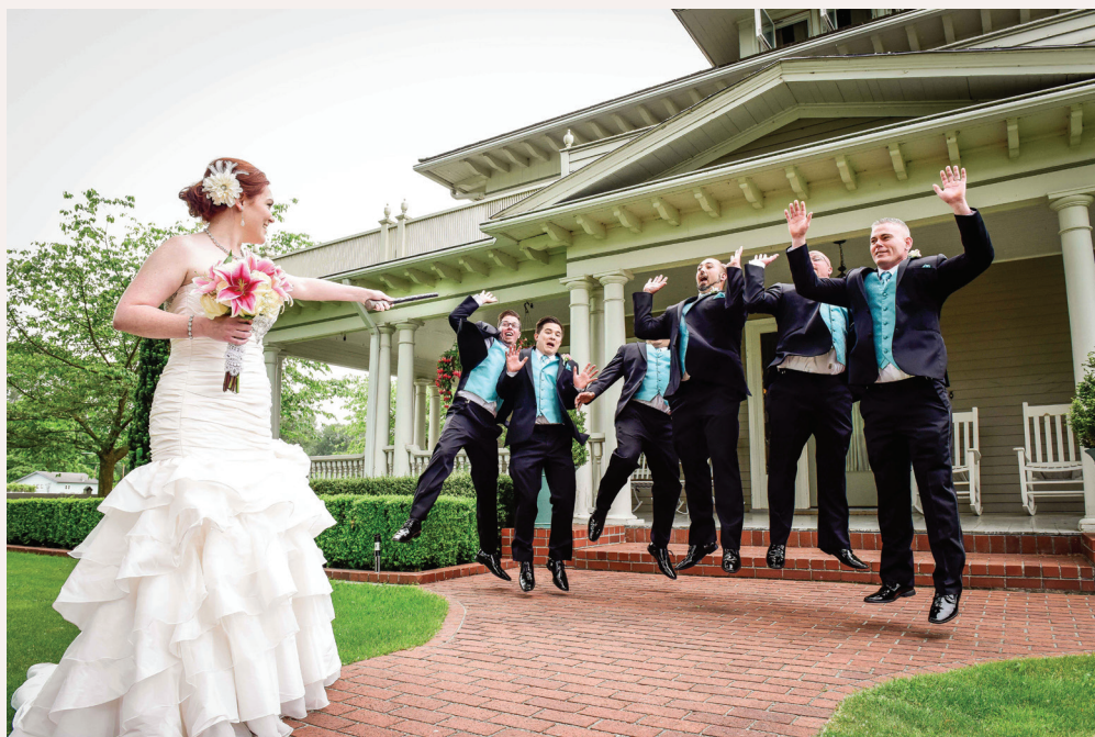
Rose-Lily Photography goskagit.com

Some of the beautiful wedding venues located in Skagit County: