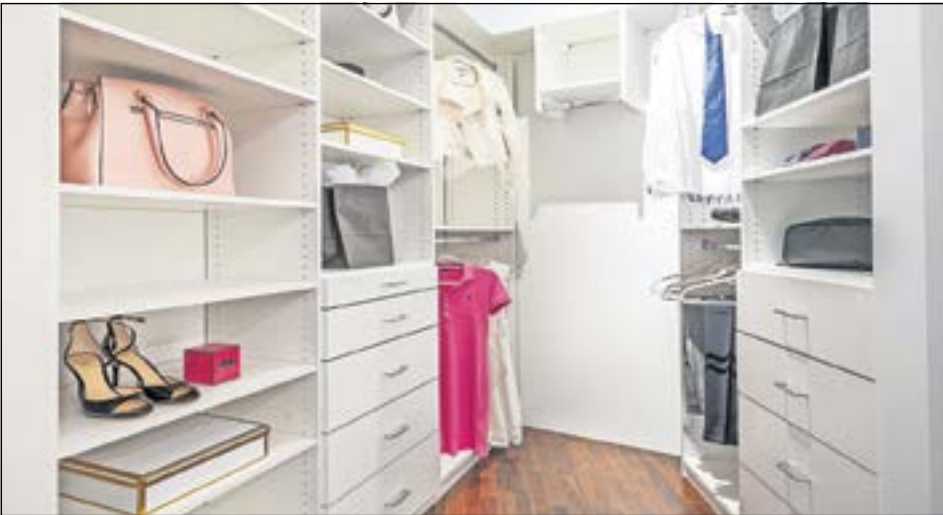
White cabinetry helps keep this closet modern and fresh.