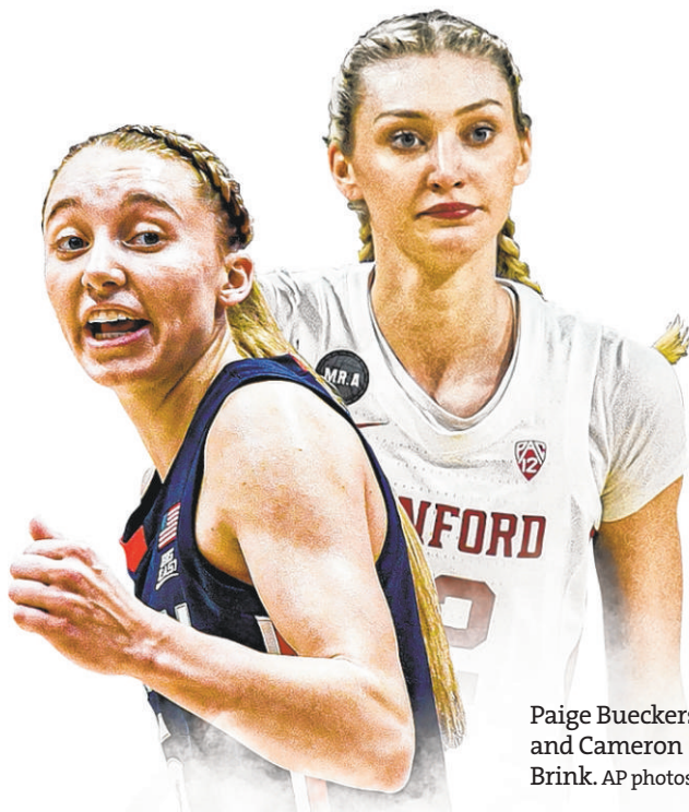
Paige Bueckers and Cameron Brink.