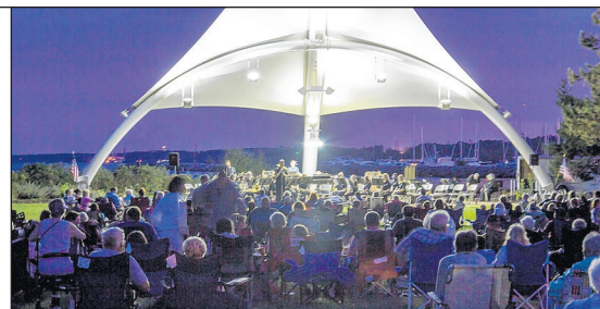
WAUKEGAN BAND FOUNDATION

Waukegan Band's annual summer concert series begins Tuesday. IN WEEKEND