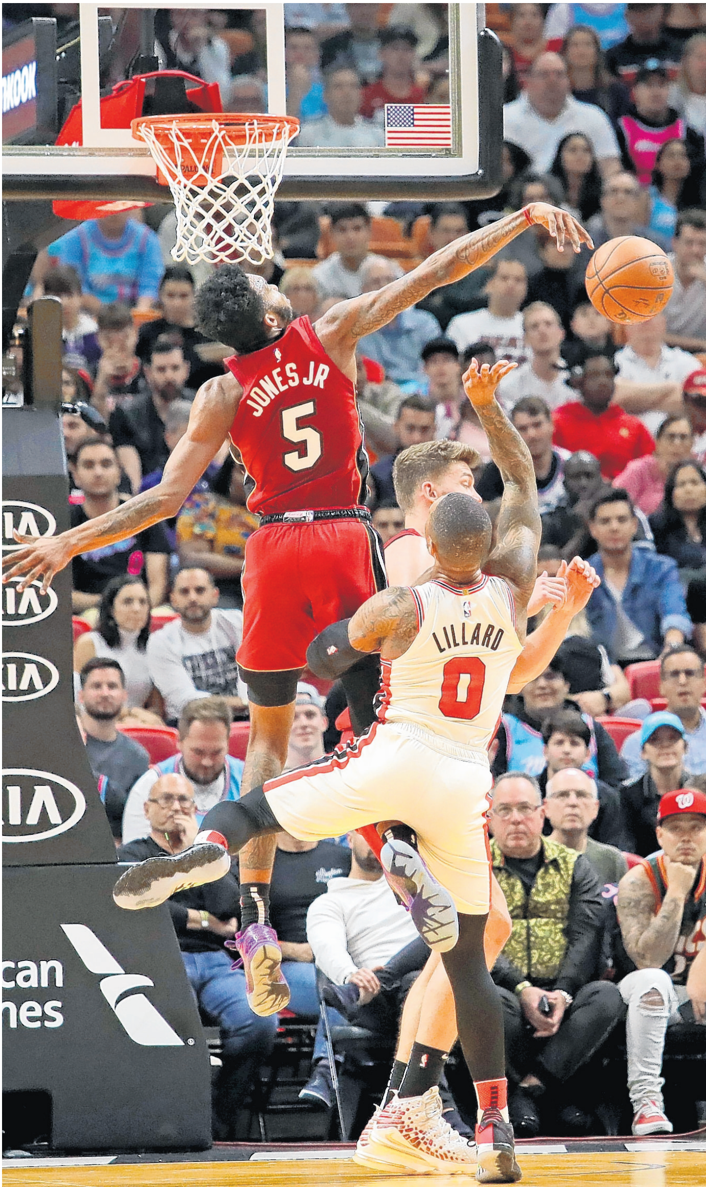
The Heat's Derrick Jones Jr. blocks a shot by the Blazers' Damian Lillard during the first half at AmericanAirlines Arena on Sunday.

Tannehill, Whiteside showed what we're missing — or aren't in Whiteside's case