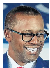
Willie Taggart has made several hires to his FAU staff since the close of 2019.

The Owls have the pieces in place for Taggart to have his most successful run as a