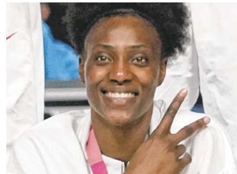
SYLVIA FOWLES • BASKETBALL Team competition "I can definitely say this was a whirlwind. Plenty of talent and people understanding their role."