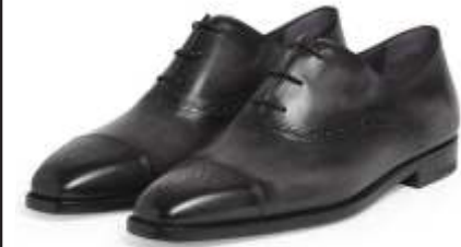
REF. 1 UPPER COW ANILINE FULL GRAIN