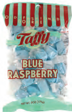
Quantity 20 packages