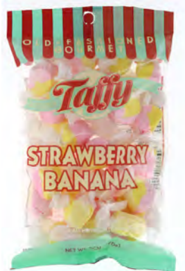
Quantity 30 packages