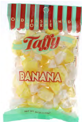
Quantity 16 packages