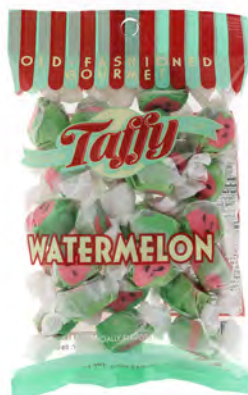
Quantity 30 packages