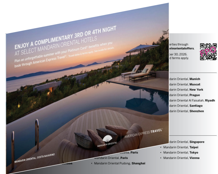
BROCHURE FRONT (OPEN)