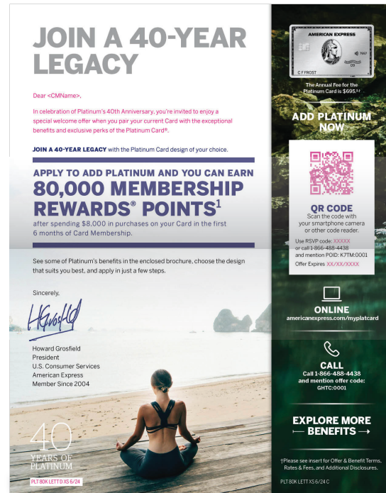
LETTER — CONTROL (FRONT)