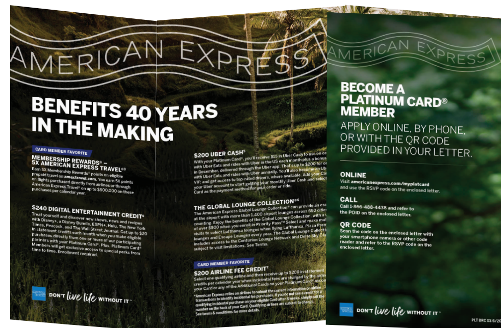
ACCORDION (OUTSIDE UNFOLDED)