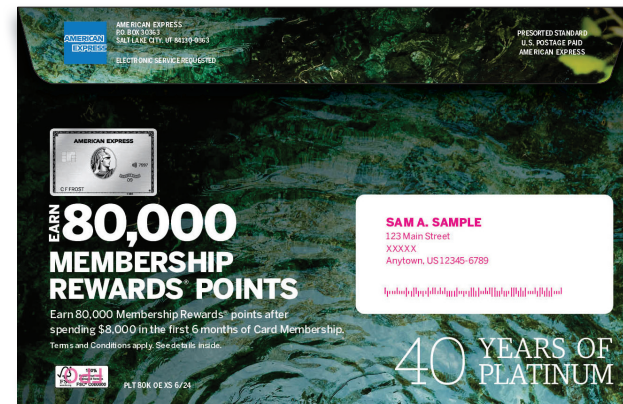
OE (ADDRESS/FLAP SIDE)