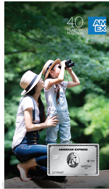
ACCORDION (FRONT FOLDED)