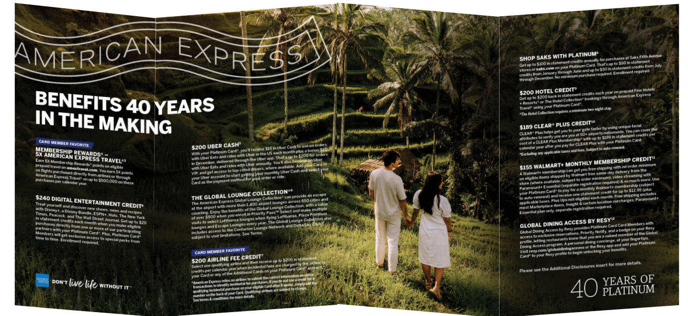
ACCORDION (INSIDE UNFOLDED)