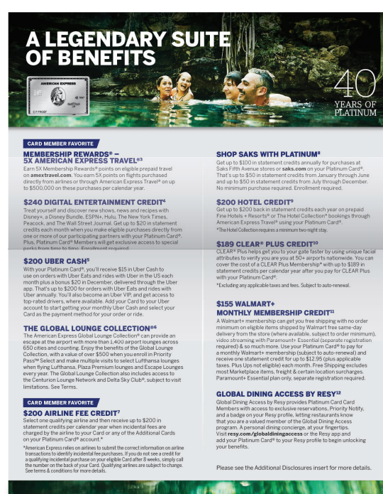
LETTER — ALL (BACK)