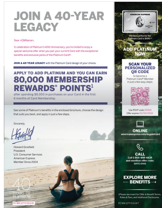
LETTER — TEST (FRONT)