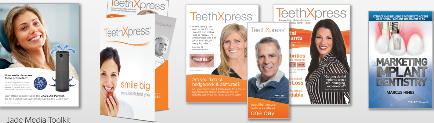
Jade Media Toolkit

Comprehensive Surgically Clean Air™ TeethXpress package: $24,995