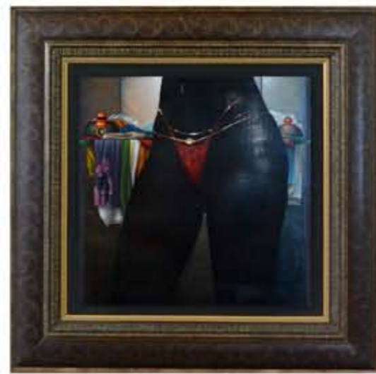
acrylic on masonite 24 x 24 in (15) Price on request