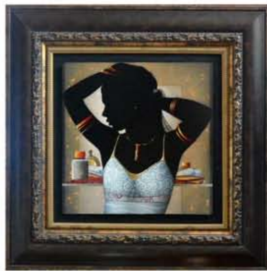
acrylic on masonite 17 x 17 in (14) Price on request