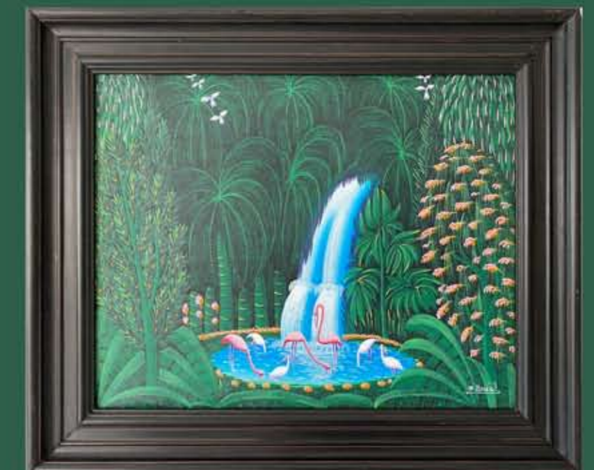
(12) acrylic on canvas 16 x 20 in Price on request