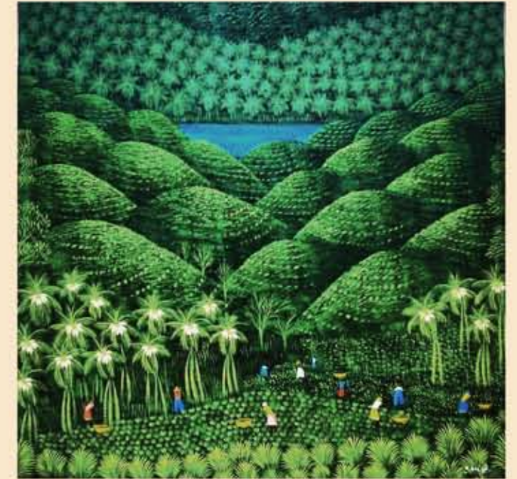
Harvest of the coconuts, Imperial provenance (7) acrylic on canvas 48 x 48 in Price on request