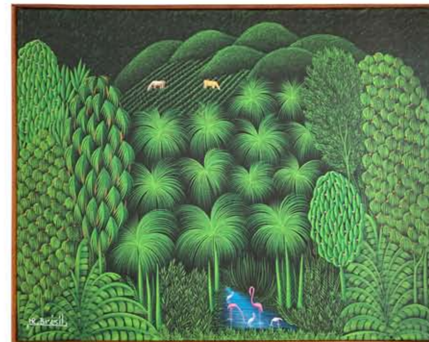
(8) acrylic on canvas 24 x 30 in Price on request