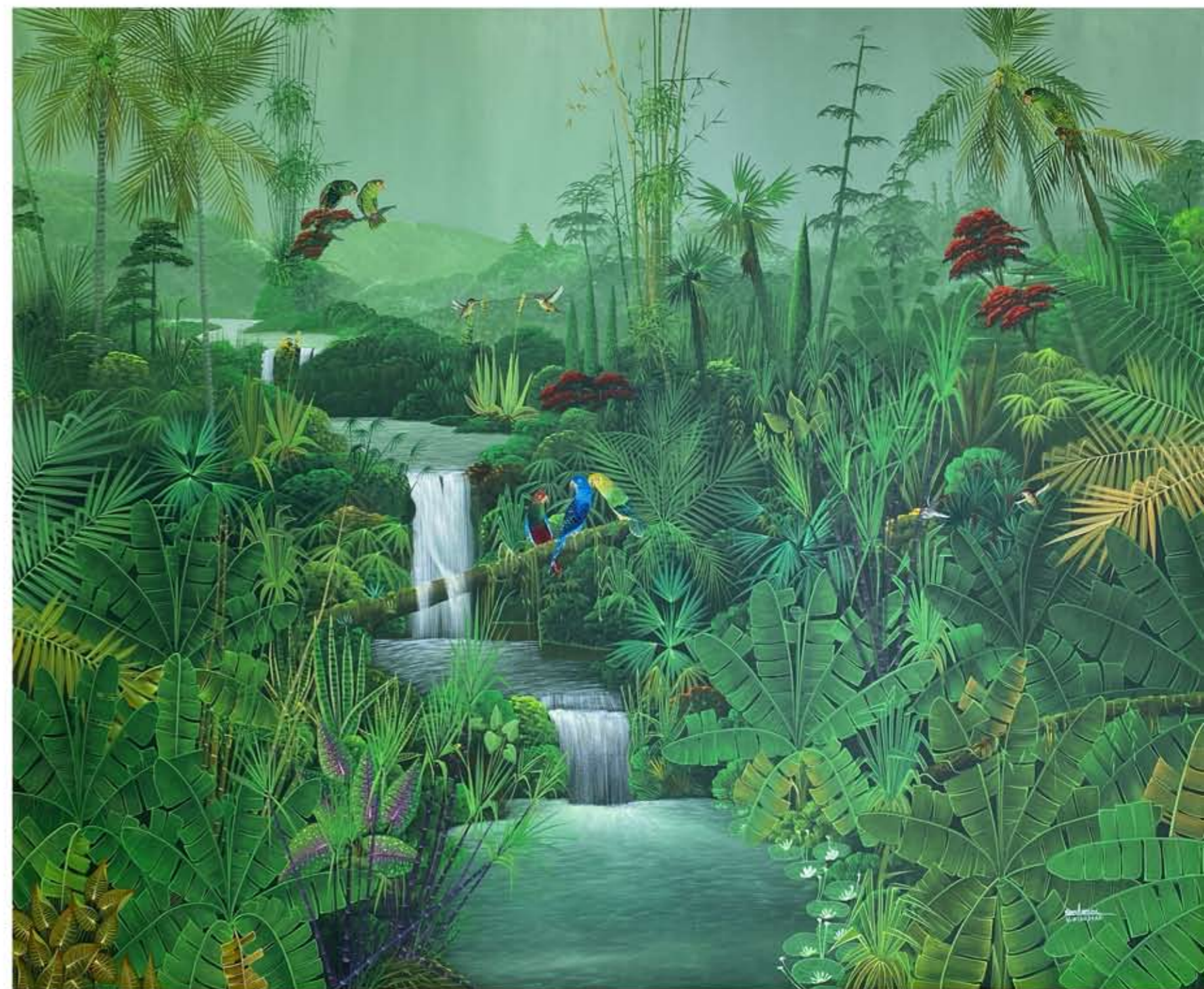
(2) acrylic on canvas 71 x 59 in Price on request