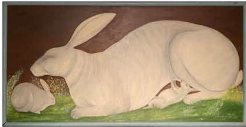
(3) oil on masonite 16 x 32 in Price on request

This takes on special meaning with the knowledge that the "white rabbit" is a portrayal of the artist himself, preaching and teaching values to those around him.