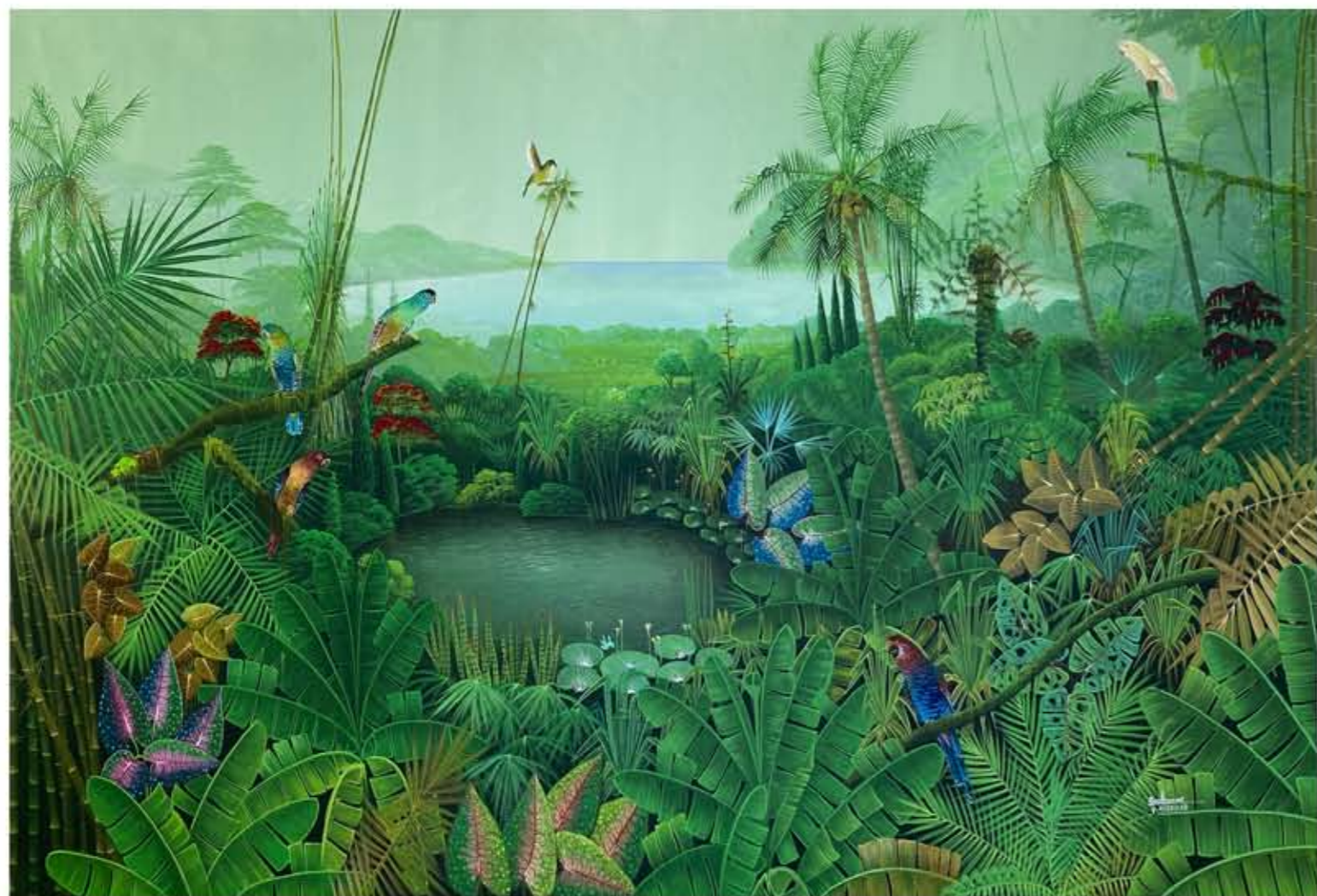
(1) acrylic on canvas 49 x 72 in Price on request

He became a professional artist in 1990 and paints birds in a luxuriant and oasis setting. He has exhibited all over the world and his art is well appreciated by many collectors, mostly in Japan and in the US. His « Tropical forest scenes evoke the environmental problems confronting Haiti »