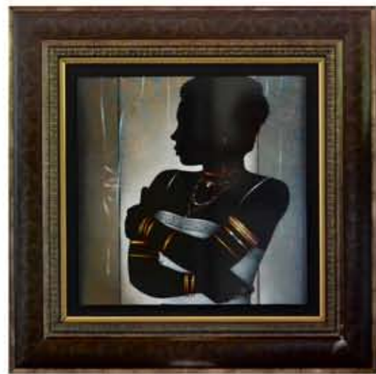
acrylic on masonite 24 x 24 in (13) Price on request

Emilcar Similien, known as Simil was born in 1944 in St. Marc. From 1965 to 1971 he studied painting, sculpture and art history at the Academy of Beaux-Arts in Port-au-Prince. Simil uses his images of women only as means for displaying patterns, color and the sparkle of gold jewelery on black skin. He paints with acrylics on masonite of any size. His surfaces are smooth and polished. Simil delights in beauty, elegance and grace. Simil is considered as a leading contemporary Haitian artists. "Well trained by masters who taught him to excell in his form, Similien's works also contain discrete messages."