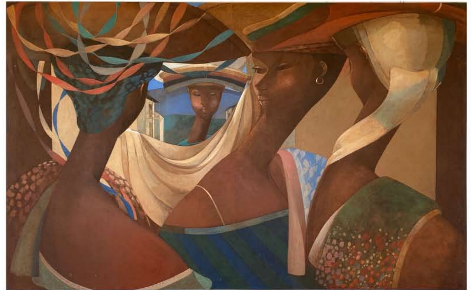
(19) oil on canvas 60 x 96 in Price on request