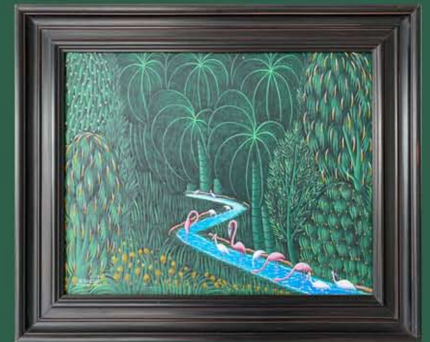
(10) acrylic on canvas 16 x 20 in Price on request