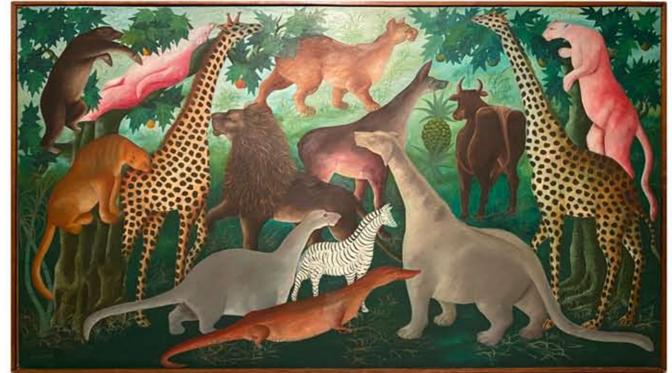
(4) oil on masonite 70 x 39,5 in Price on request