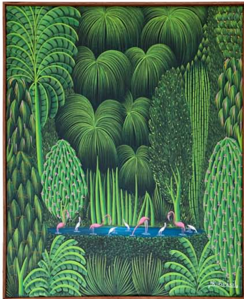
(6) acrylic on canvas 30 x 24 in Price on request