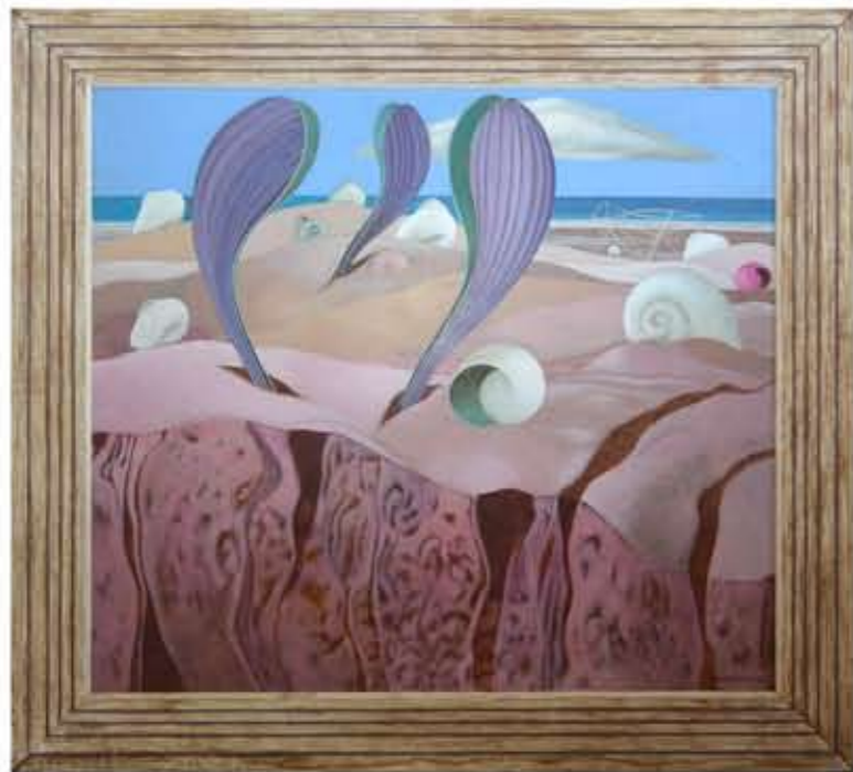
(17) oil on masonite 32 x 36 in Price on request

Séjourné's solo exhibits at the Beaux-Arts Gallery and the museum at St. Pierre's College in 1975 and 1985 were memorable events in Haiti. Painter and sculptor, Séjourné is among the best known artists of the School of Beauty, which honors woman.