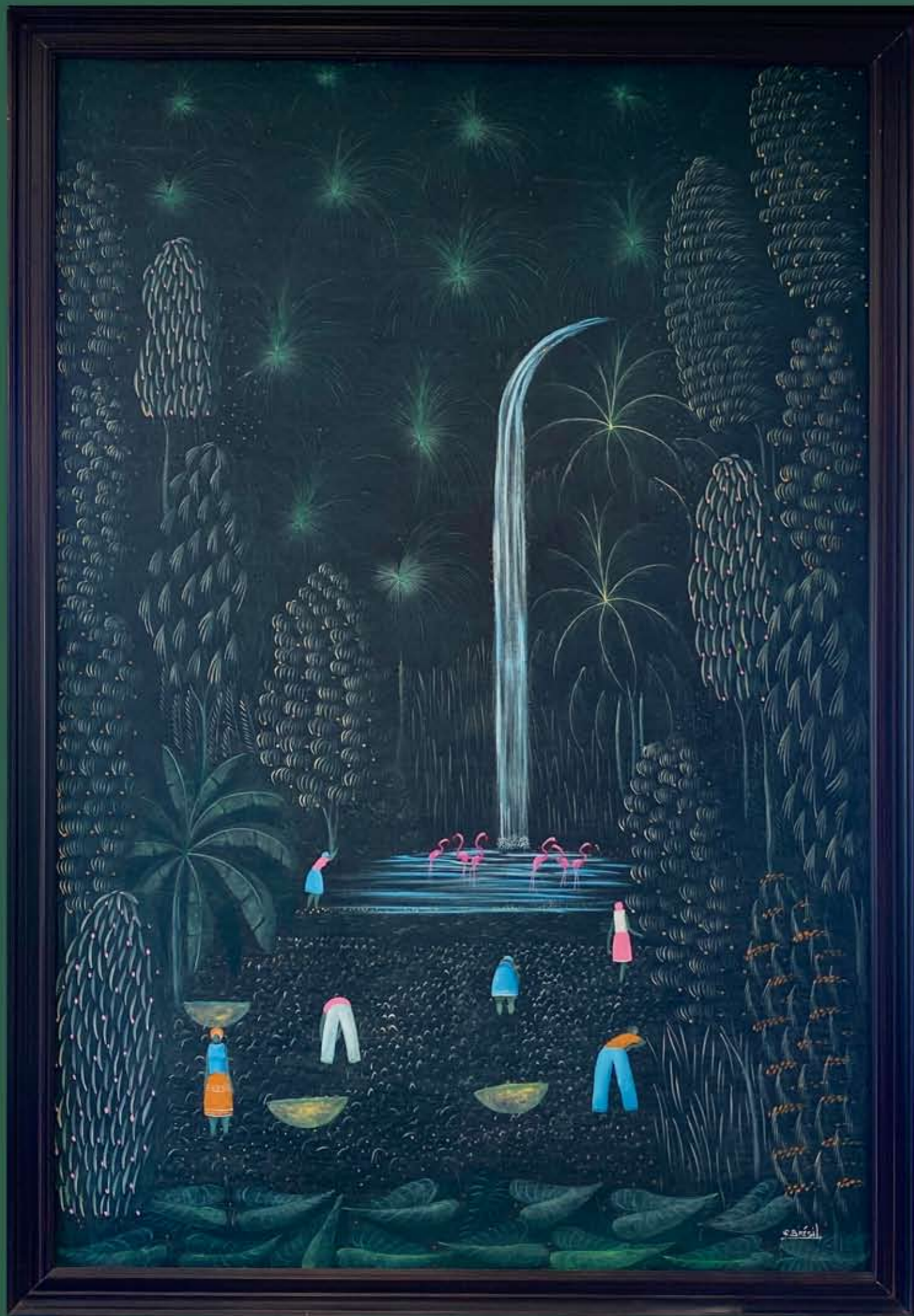
(9) acrylic on canvas 72 x 48 in Price on request