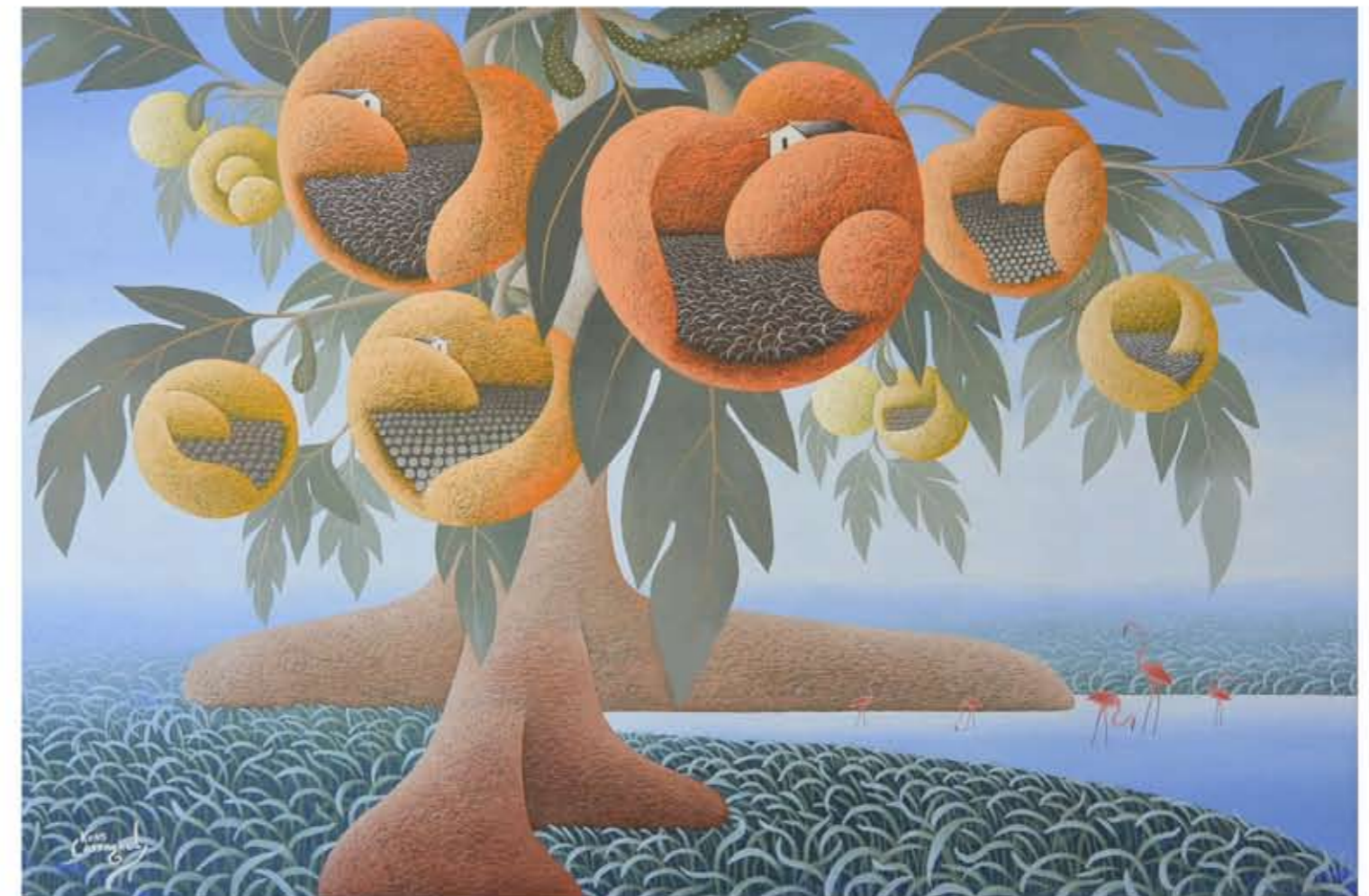
(16) acrylic on canvas 48 x 72 in Price on request