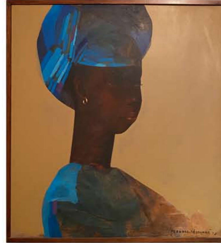
(18) oil on masonite 34 x 32 in Price on request