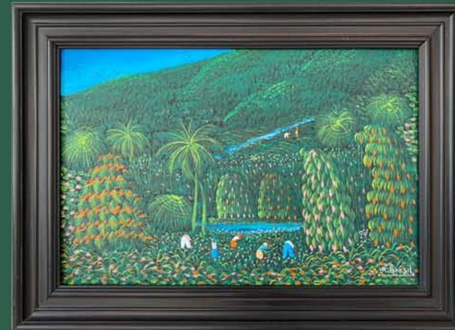
(11) acrylic on canvas 16 x 24 in Price on request