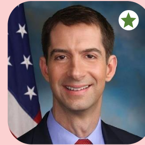
TOM COTTON Arkansas