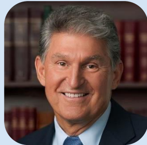
JOE MANCHIN West Virginia