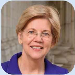
ELIZABETH WARREN Massachusetts