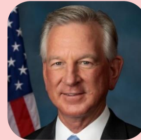
TOMMY TUBERVILLE Alabama