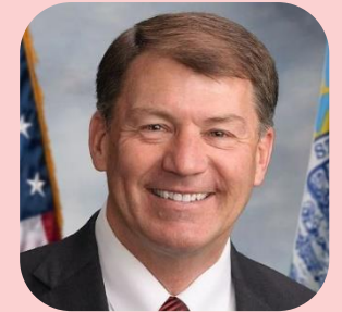
MIKE ROUNDS South Dakota