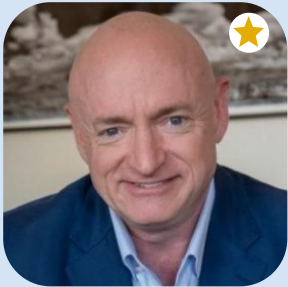
MARK KELLY Arizona