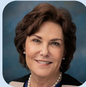
JACKY ROSEN Nevada