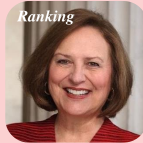
DEB FISCHER Nebraska