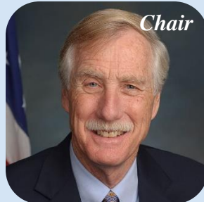
ANGUS KING Maine