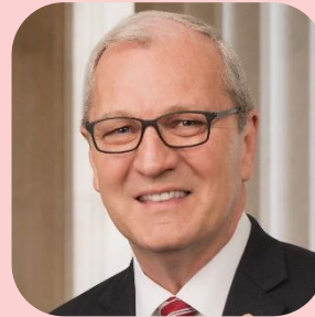
KEVIN CRAMER North Dakota