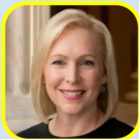
KIRSTEN GILLIBRAND New York