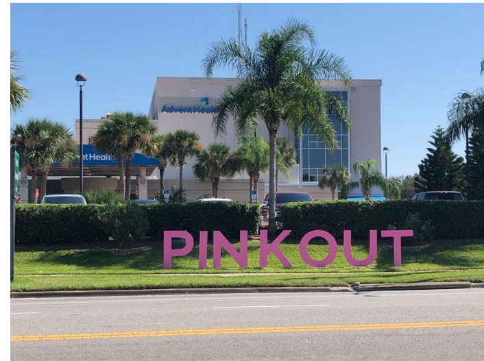
New Smyrna Beach