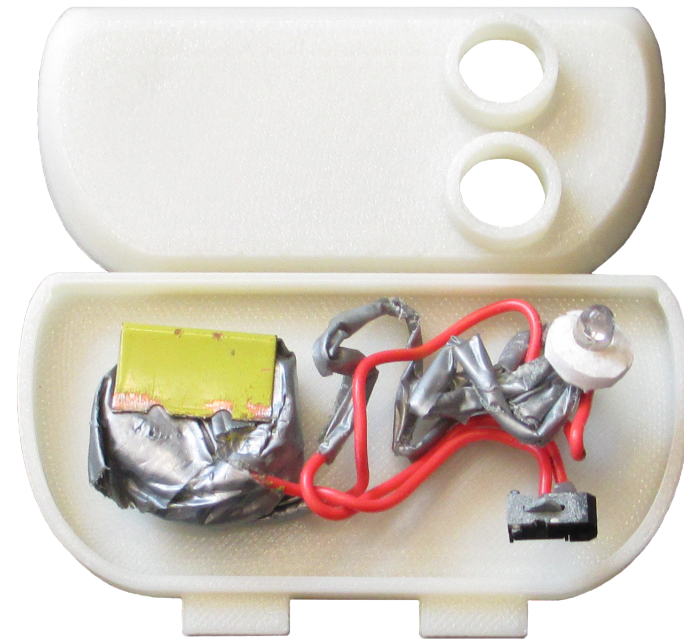
3. Electrical components for prototype to simulate the blue LED lit when recording a sound with the vest