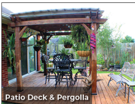
Patio Deck & Pergolla