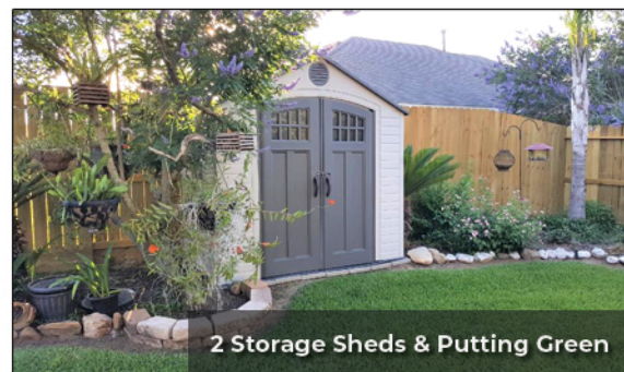
2 Storage Sheds & Putting Green