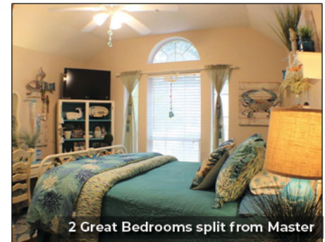
2 Great Bedrooms split from Master