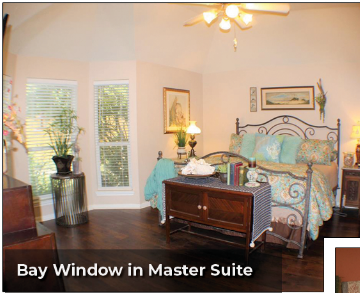
Bay Window in Master Suite