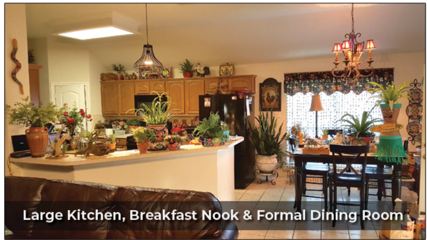
Large Kitchen, Breakfast Nook & Formal Dining Room