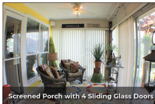
Screened Porch with 4 Sliding Glass Doors