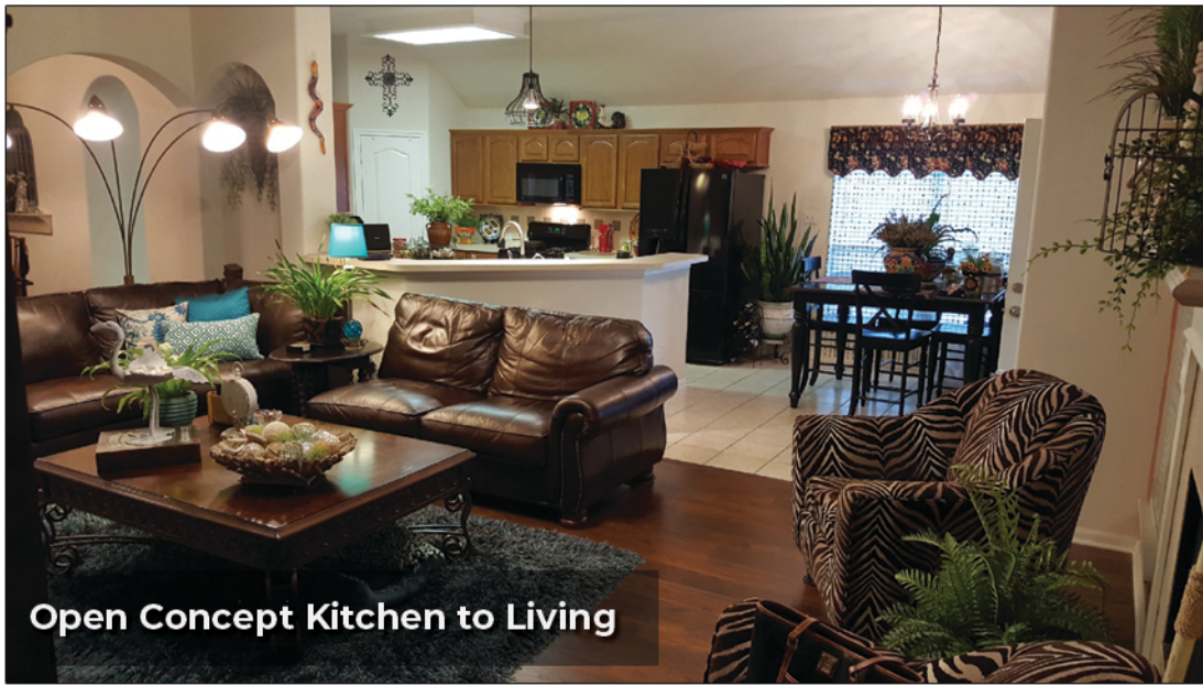
Open Concept Kitchen to Living