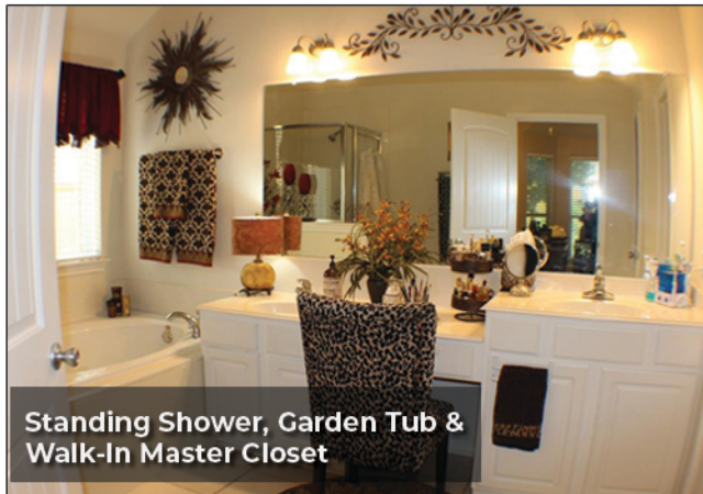
Standing Shower, Garden Tub & Walk-In Master Closet