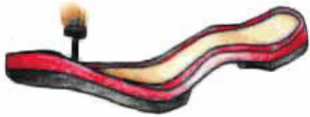
GRACE JONES MORNING SHOE