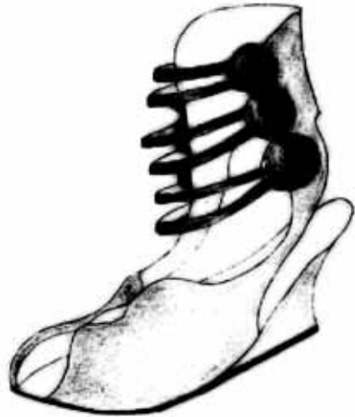
GRACE JONES DAY SHOE