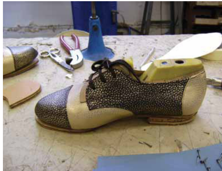
Final Oxford Shoe Product on Last

Requirements: Design shoe, cut out pattern pieces, cut out leather, and construct shoes.