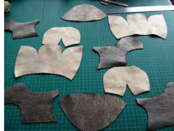
Uppers and Vamp Pieces