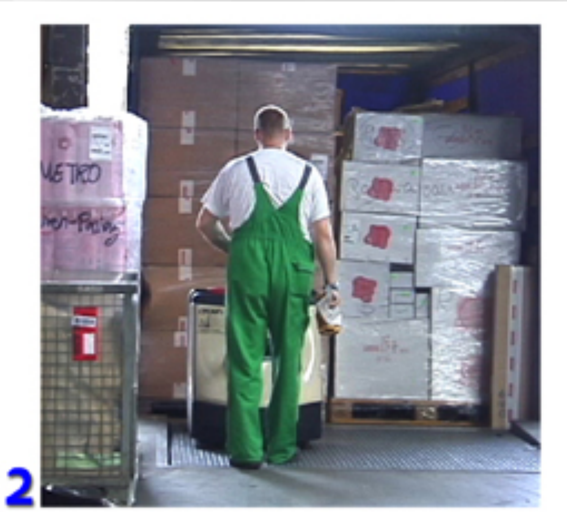
2 Lower/travel blend