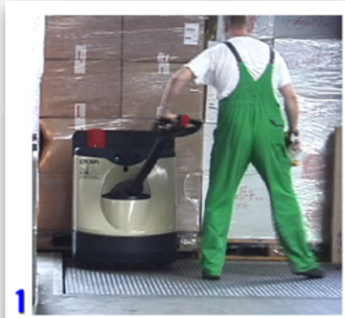
1 Place pallet