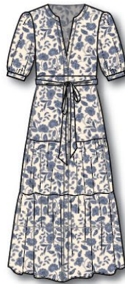
COLORWAY: SAND 1177-1 PRINT