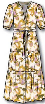
COLORWAY: IVORY GREEN MULTI 2025-1 PRINT