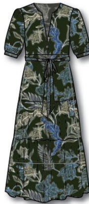
COLORWAY: GREEN MULTI 1147-1 PRINT