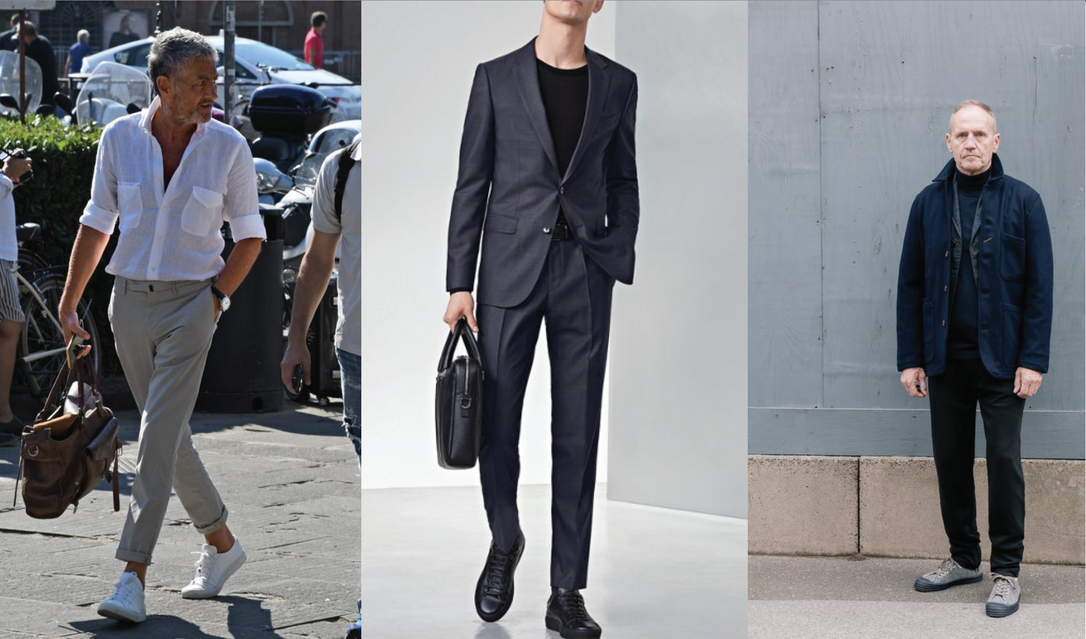
BUSINESS AND EVERY-DAY