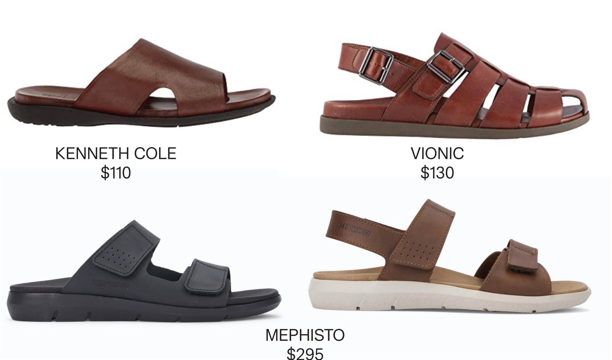
CLEAN DRESS CASUAL FOR THE SUMMER