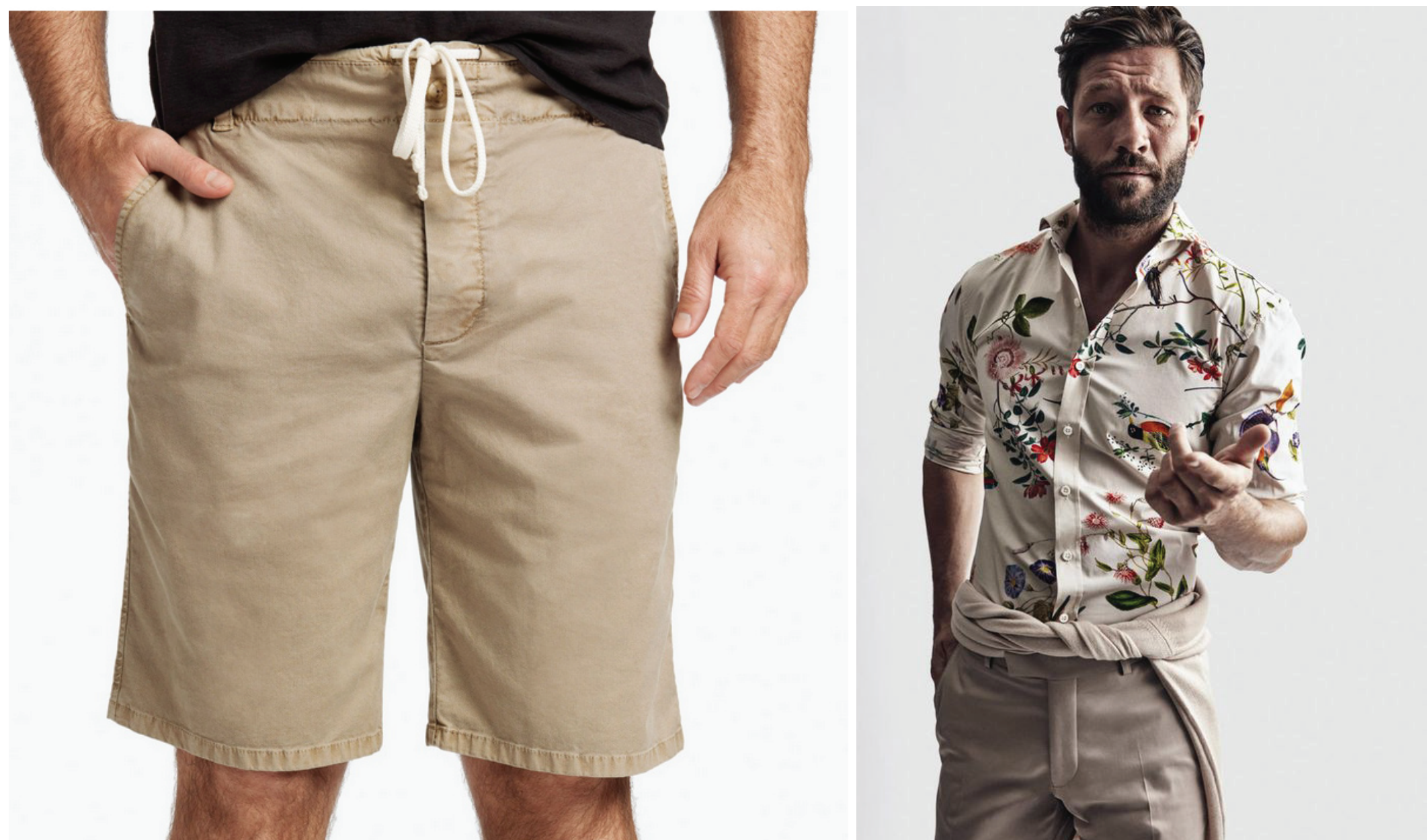
LEISURE AND EVERY-DAY