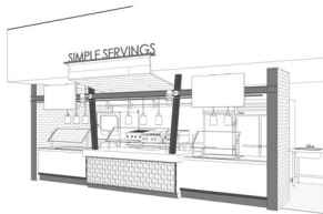
2 SIMPLE SERVICES 3D VIEW