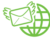
Free Customized Exhibitor Email Campaigns