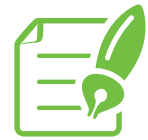
Mailing List Rental ...And much more