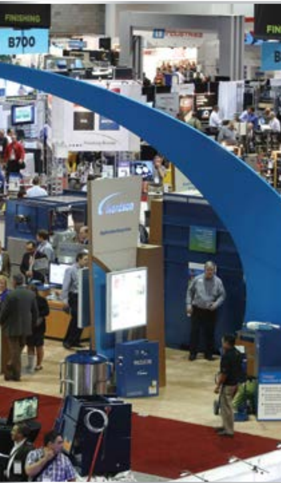
Exhibit And They Will Come? Better Not Leave It To Chance.

Use this recommended plan to help you prepare for FABTECH 2015.