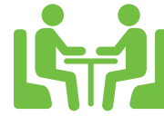
Advertising and Sponsorships