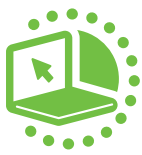
Free Print and Online Directory Listings

Unless they're incredibly lucky, it comes down to one thing: success starts with a plan. And to help you in your planning, we developed a number of marketing tools you can use to get the most from your FABTECH investment. Whether you need a lot of help or just a little, this guide identifies numerous ways for you to promote your exhibit at the event, reach new prospects and raise your company's profile in the media and industry. Here are some examples: