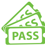
Free Guest Passes for Your Customers and Prospects